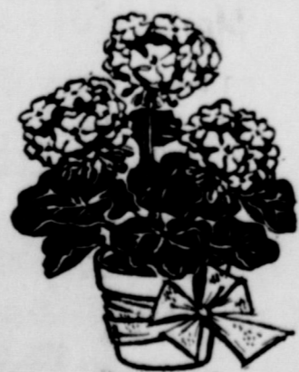
FLOWERS FOR ALL OCCASIONS