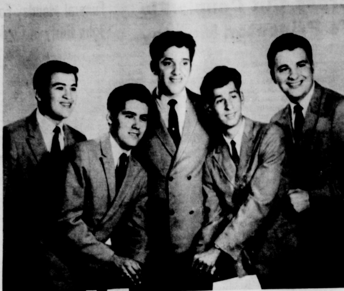
COMING HERE SUNDAY — The Royals of San Antonio, a group of five Latin-American gospel musicians and vocalists, will be at the Revival Center on State Highway 36, here Sunday night. Their program of gospel music will begin at 8 p.m. The above picture shows the young men, ranging in age from 17 to 21, who will make the Cross Plains appearance. The public is invited to attend.