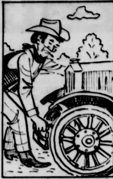
BOSS HAD A DRIVER'S LICENSE ONCE, BUT HE SEZ HE DRIVES JUST AS GOOD WITHOUT ONE.

In addition to the new items to be checked, stations will examine brakes, lights, horn, all warning devices, windshield wipers, front seatbelts in vehicles where anchorages were part of the manufacturer's original equipment. The inspection also includes steering and wheels.