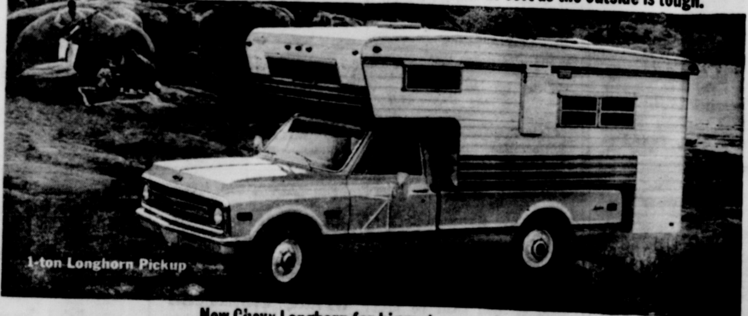
1-ton Longhorn Pickup

An inside as soft as the outside is tough.