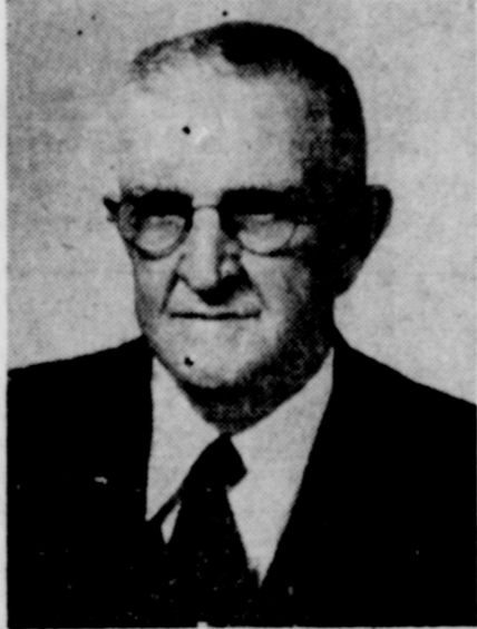
Sage Of Cross Plains

ture and instead we use the word sanitarium, a place where sanitation reigns supreme.