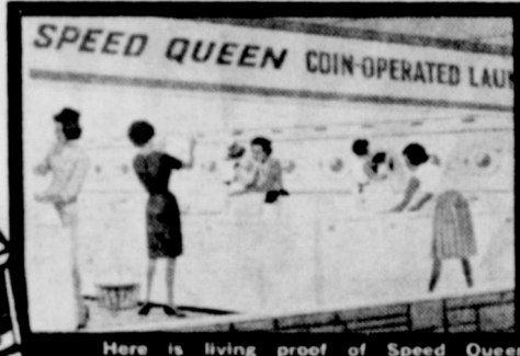
Here is living proof of Speed Queen dependability. You can have the same dependability in your home.

Simple to operate Any part of cycle can be skipped or repeated. You're always the "boss"