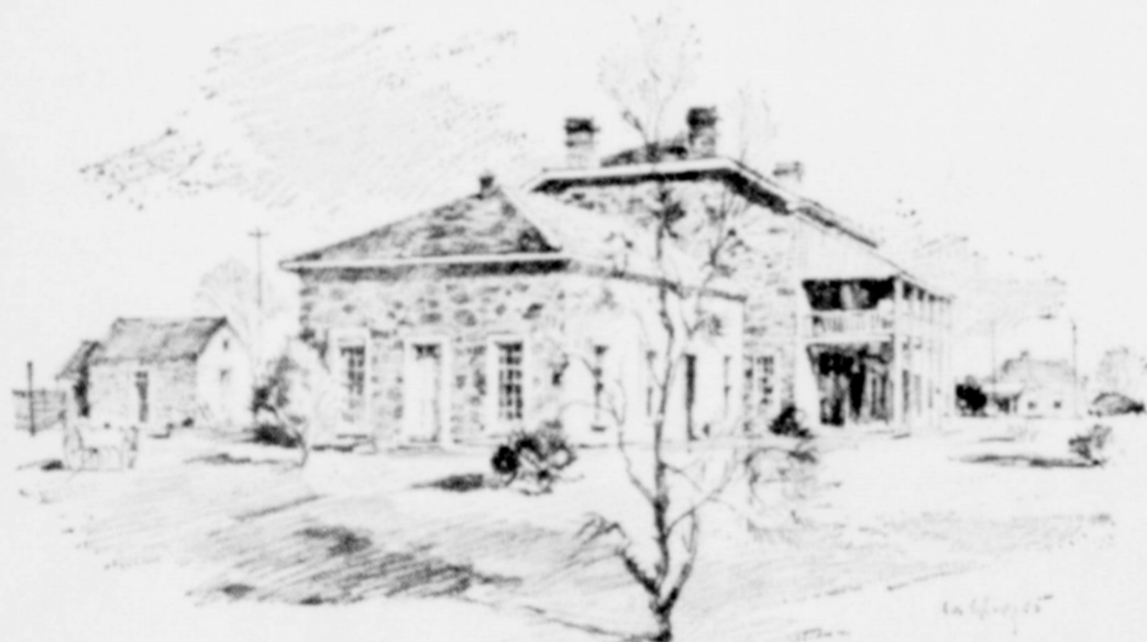
Old Buildings at Fort Richardson