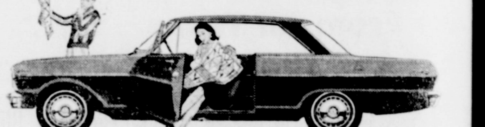
'65 Chevrolet Nova Sport Coupe