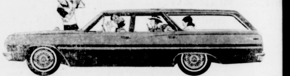
'65 Chevrolet Malibu 4-Door Station Wagon