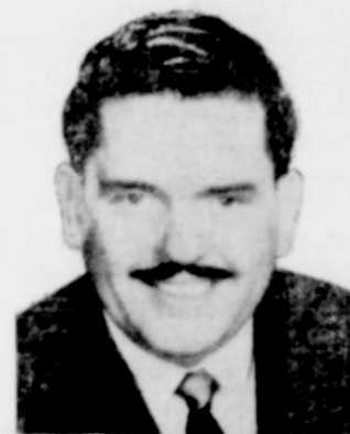
Howie Lister BATTLE OF SONGS