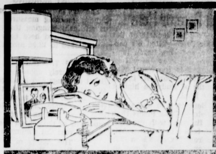
WHEN YOU'RE FEELING DOWN...