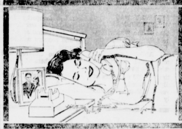
REACH FOR THIS WONDERFUL PICK-UP!

When you're sick, you might have to be alone... but you don't have to be lonely! Just make sure you have a telephone handy. It's a wonderfully fast and pleasant way to keep up on everyone and everything. Call us today for your new bedroom extension tomorrow. Sick or well, you'll be glad to have it near.