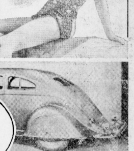
IDEAS ABOUT STREAMLININ changed slightly during the past thre The front end of the "Slipper" was started in the "Tour de France" tapers down to a point like the rear 1935 Airflow De Soto Coupe (right)