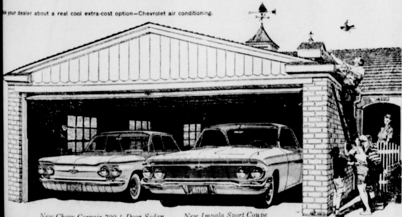
New Chevy Corvair 700 4-Door Sedan New Impala Sport Coupe

Ask your dealer about a real cool extra-cost option—Chevrolet air conditioning.