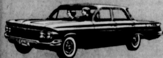
New Bel Air 4-Door Sedan—Popularly priced and packed with all the Chevy virtues.