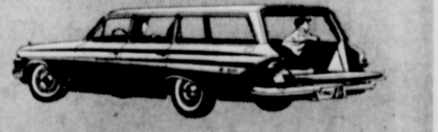
New Nomad 9-Passenger Station Wagon—Most luxurious of Chevy's six best selling wagons.

See the new Chevrolets at your local authorized Chevrolet dealer's