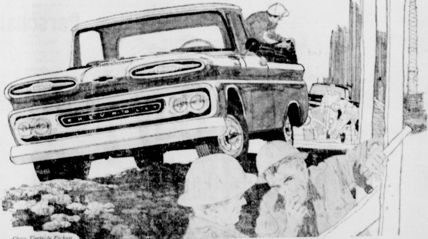
Chevy Fleetside Pickup

You'll get the best buy on the best selling brand at your Chevy dealer's Truck Roundup!