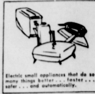
Electric small appliances that do so many things better... faster... safer... and automatically.