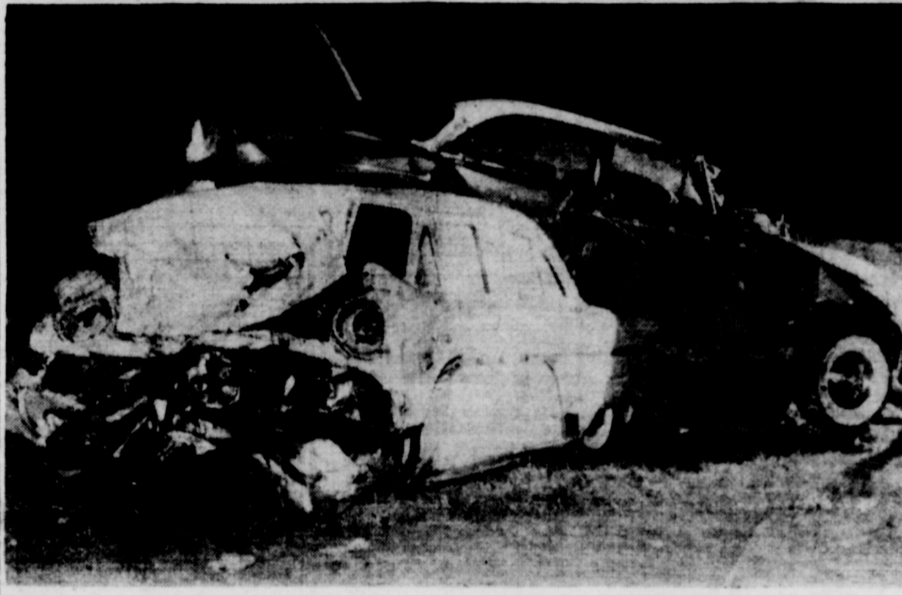
TRAGEDY SCENES — Photos show the autos involved in a head-on collision just north of town on Farm Road 880 here last Thursday night in which two girls lost their lives and seven other youths were injured. The cars came to rest one on top of another on the west side of the road about 100 yards north of Bryant Airfield office.