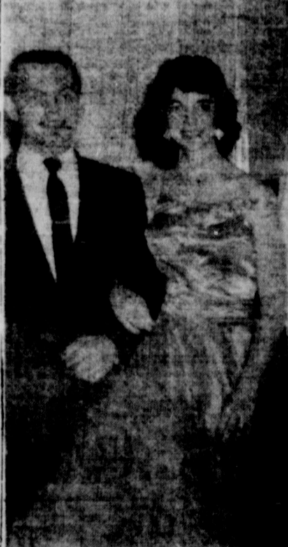
HIGH SCHOOL BEAUTIES ... Pictured above, the three most beautiful girls in high school escorted by the three most handsome boys. The girls were chosen in the annual contest held at the school auditorium last Thursday night and the boys were chosen recently by popular vote of the girls in high school.