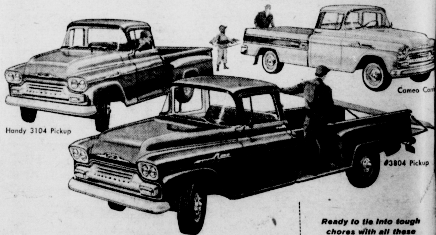
Handy 3104 Pickup