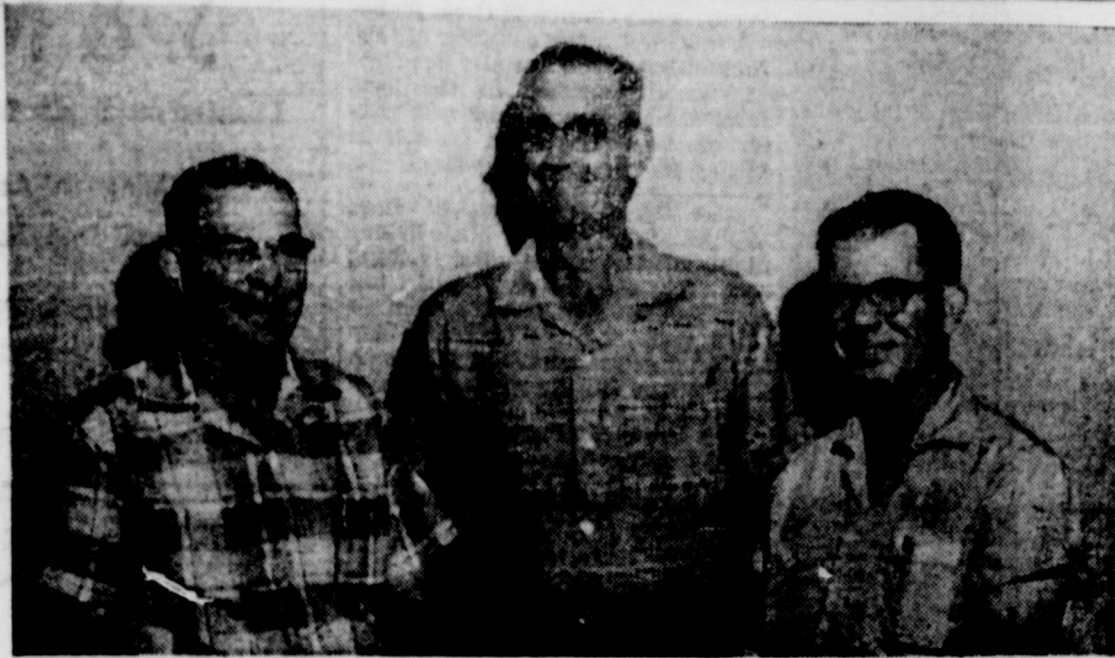
NEW C-C OFFICERS... Officers of the Chamber of Commerce who took over at the first annual chamber banquet held here Friday night of last week.