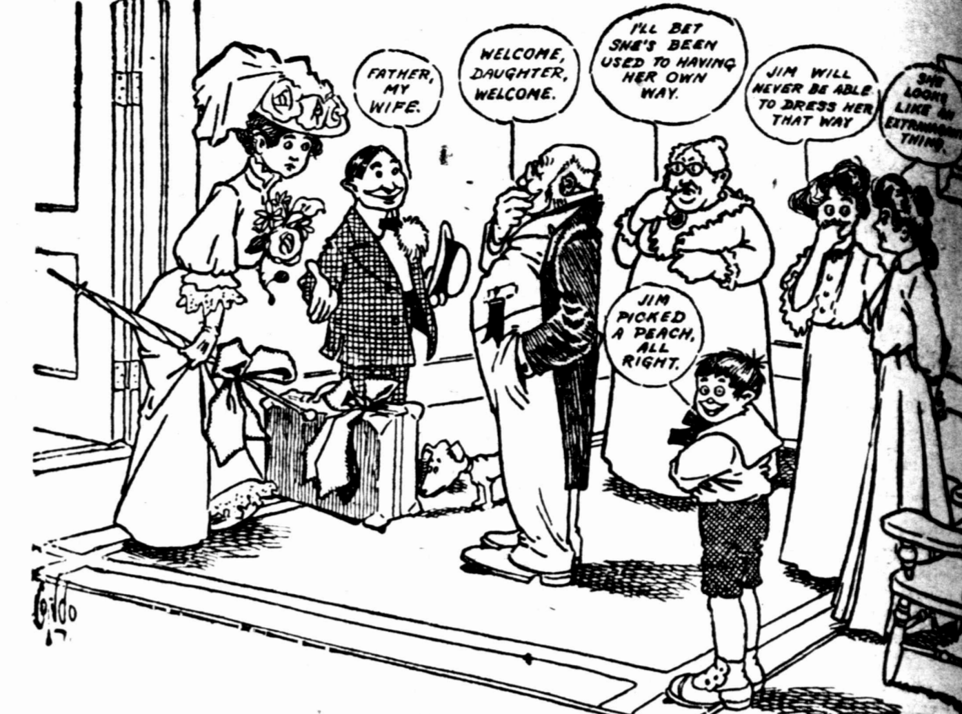
How sweet it is to meet the bridegroom's folks and let them size you up.