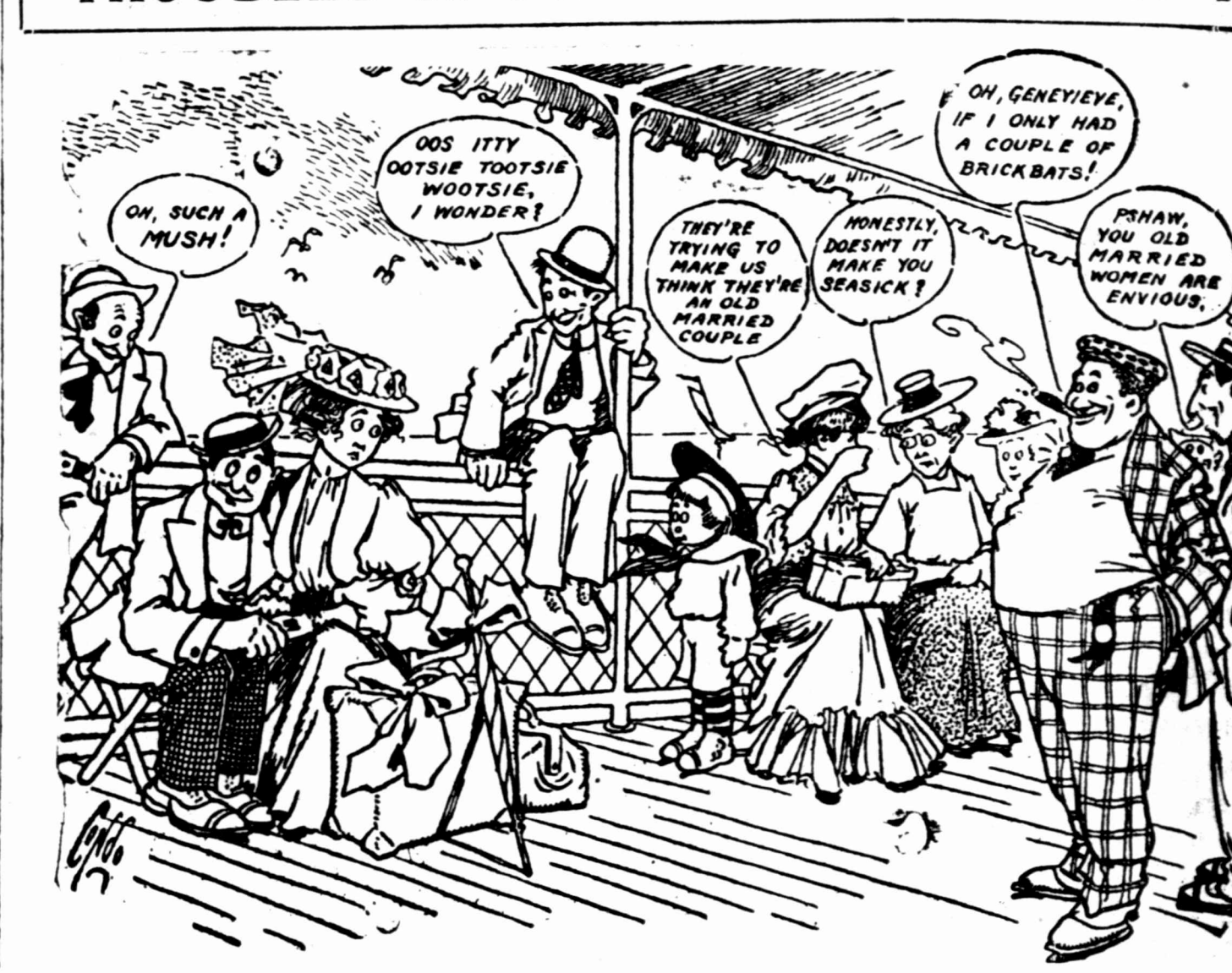
The people you meet on the wedding trip also try to make it pleasant for you.