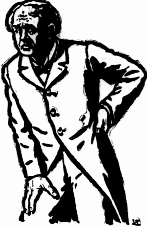
"Every Picture Tells a Story"

When the kidneys are sick, every sudden twist or movement sends a sharp pain coursing through the back. As the trouble gains ground, the pain strikes you first in one place, then in another, until you never know when or where it will come next.