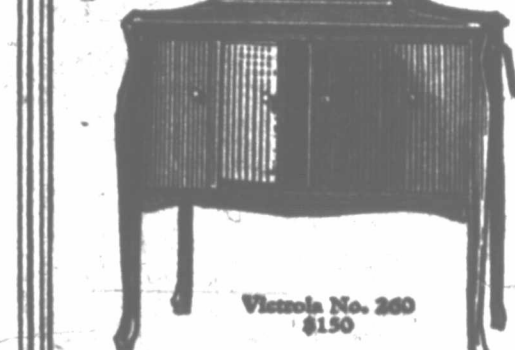
Victrola No. 260 $150