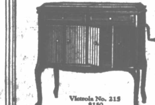
Victrola No. 215 $150