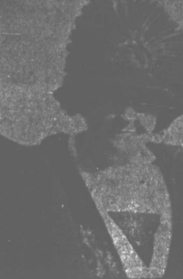
President of the National Labor Union, J. P. Morgan, speaking at a meeting of the organization.