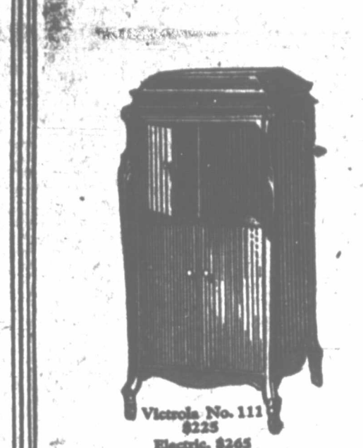
Victrola No. 111 $225 Electric, $265

There are twenty-one different styles of Victrola instruments, varying in size, design and price—and each one represents the highest quality and the utmost value for the money. On Victor Records you get your kind of music by the artists you want to hear—the greatest in their particular fields. The best music and the latest music—new Victor Records are now issued every Friday.