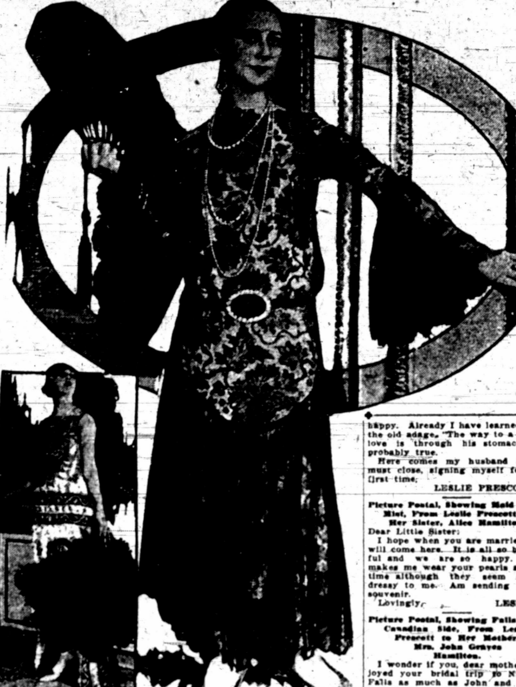
The Spanish costume above is as much in style here in America as abroad. So is the Egyptian dress, below.

Every European peasant woman has been called upon to yield her colors and embroidery patterns, and now we are copying the entire costume direct. The three fashionable silhouettes of the year are all from across the water. The skirt that is scooped up in a front drape and pulled tightly over the hips and back is Indian.