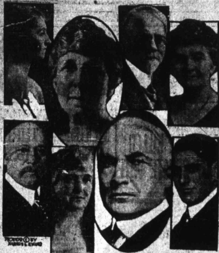
President Harding leaves capital for a four weeks' rest at various Florida points. Picture shows members of the president's official party.