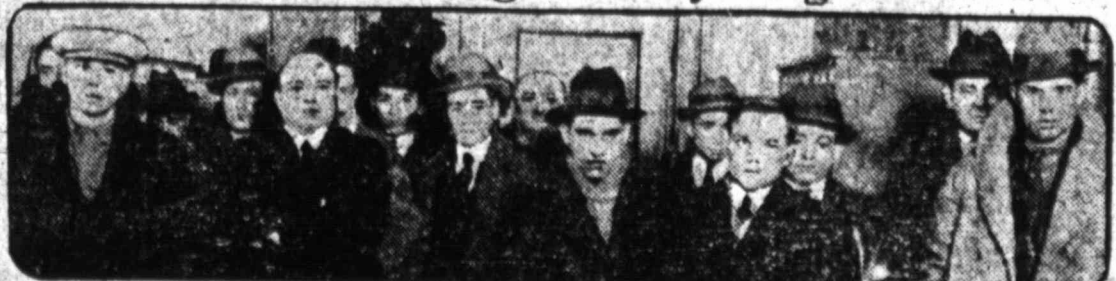
In one of the greatest round-ups of counterfeiters ever conducted, police of New York and New Jersey broke up what they say is a great international conspiracy to circulate $1,000,000 in counterfeit American money. Some of the 22 arrested in New York and held on counterfeiting charges are shown above.