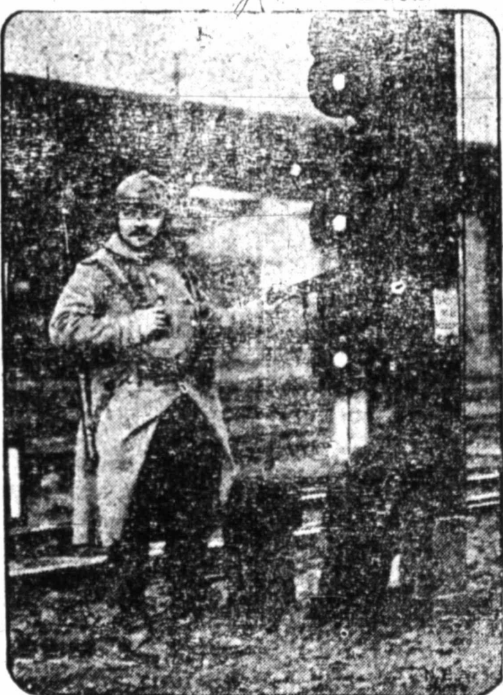
Lines of communication have been thrown into a hopeless tangle by the strike of German workers in the Ruhr. Here is a French militia acting as switchman in Recklinghausen railroad yards for one of the infrequent trains.