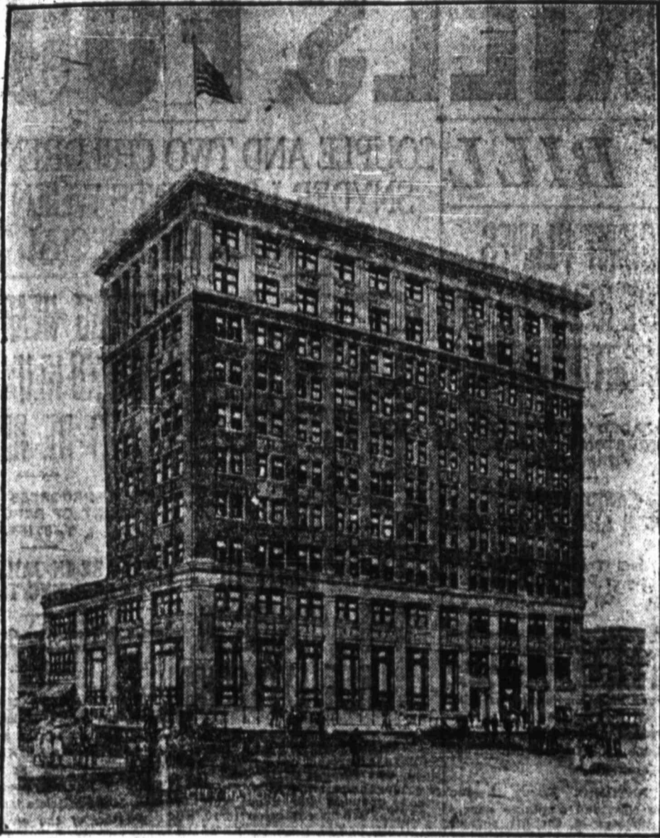
One of the several large buildings that have been built in the past two years.