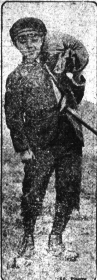
Some coal comes from the Ruhr mines—enough to supply the homes of the miners. Here is the son of a miner of Bochum carrying a sack of coal to his home from the mine. Natives are most hostile to French.