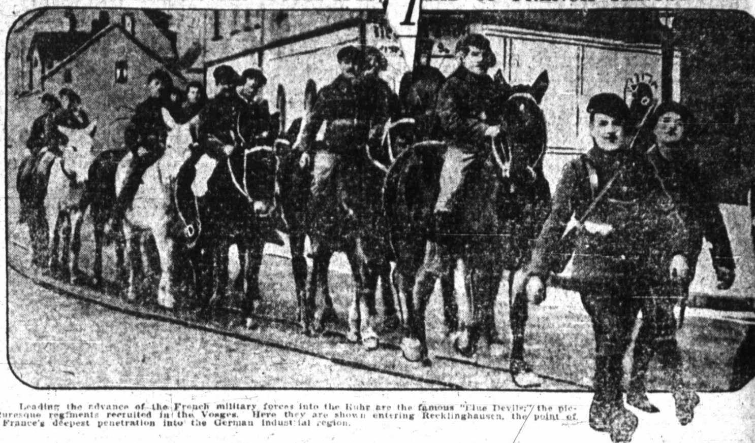
Leading the advance of the French military forces into the Ruhr are the famous "Blue Devils," the picturesque regiments recruited in the Vosges. Here they are shown entering Recklinghausen, the point of France's deepest penetration into the German industrial region.