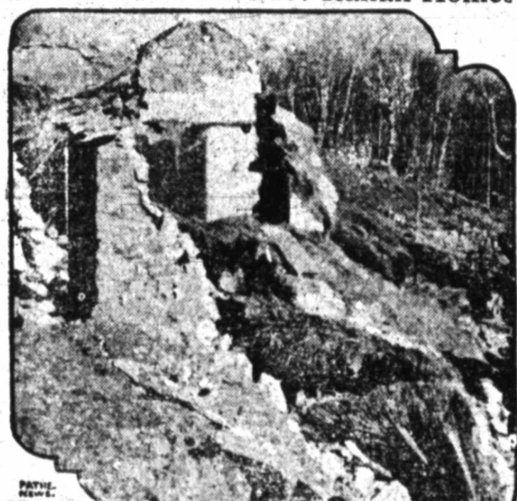
Great suffering was caused in Modena, Italy, when the small town was nearly wiped out recently by a landslide which swept down the mountains. Here is a section of the destroyed area.