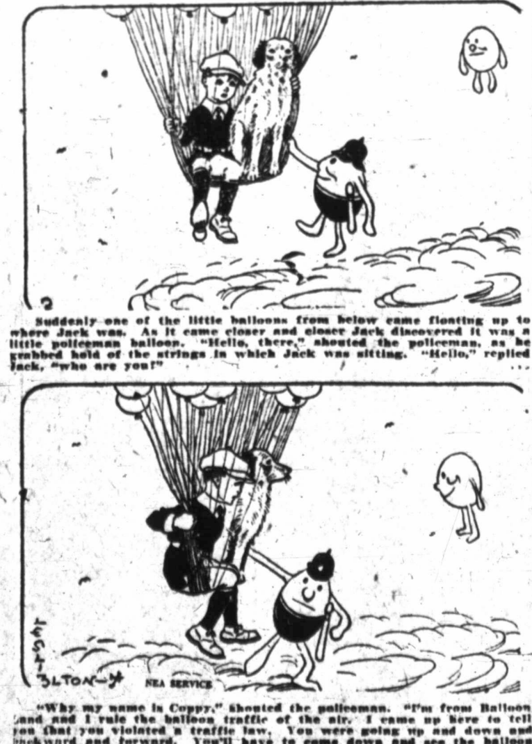
"Why my name is Copsy," shouted the policeman. "I'm from Balloon land and I rule the balloon traffic of the air. I came up here to tell you that you violated a traffic law. You were going up and down and backward and forward. You'll have to come down and see the balloon traffic judge." (Continued.)

LIAMS excess of the would begin The from in 19 18) and July followed by a d that about basis wheat Europe, the d but little toe was his lower May $1.15 to $1.20 d with wheat off. May 21 out an ad- mation took announced May 21 to be ide to $1.30 and later or with grain of wheat The Country alive 1922. Front- money extra $ 2.15. of. Coffee 10 12 May 11 22 of. Sugar for approximately 2.41. July December 25 centrifugal d fine gran- NANCIAL 2.-Resum- line, parti- American the appear- but active market. Bal- ce, virtually re recording points in in- exceptionally the January "So," Cana- Pacific were ations were of special- ing Carberg I being con- d closing was imated 192- INDED BAVARIA -Thirty per- in a club onal social Augsberg in arkwest of of Nevada LINE PRACTICE 3.-Evalu- victims of unconfined foreign ing and get practice during the ganized in Asian fan mobilized Optical Co. Times Office DAY it 200,000 0,000 ices.