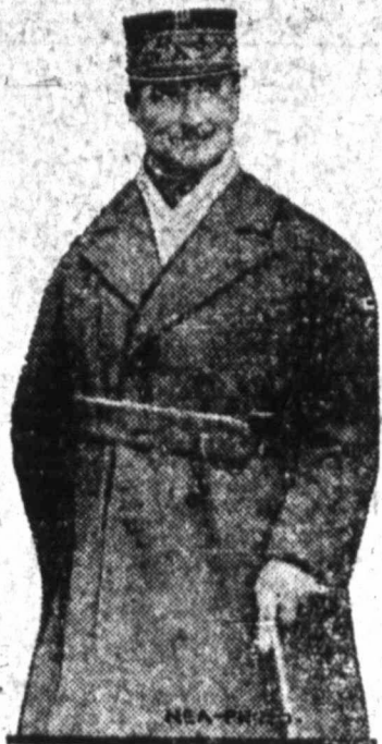
Troops of the Ruhr populace has been directed at General Mangin, commander of the French cavalry in the Ruhr. The riding cross of his officers have contributed to the dangerous attitude of sullen hatred on the part of the populace.