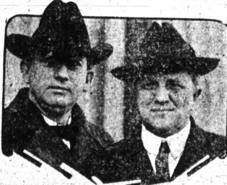
When Senator-elect Clarence C. Dill (right) of Washington takes his seat March 4, Senator Pat Harrison of Mississippi will relinquish his title of the "baby of the Senate." Senator Dill is 33 and Senator Harrison 41.