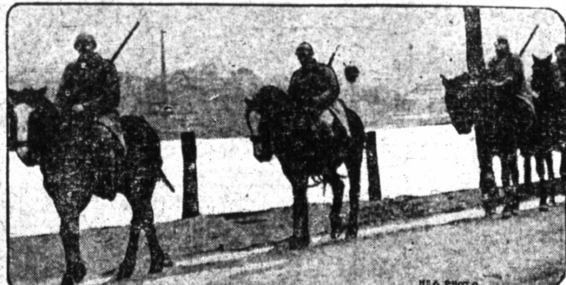
A French patrol is shown here returning at dusk from a tour along the bank of the Ruhr-River between Warden and Klittingen.