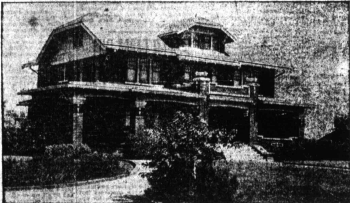
One of Wichita Falls' Fine Homes

A total of $1,362,519.96 was spent in the improvement and building by the property owners of Wichita Falls during the 365 days of 1922. At any rate this is the amount of the permits issued by the city clerk's office for all construction and improvements of property where the expense was in excess of $50; an average of $3732 a day was spent for the construction of new homes, business property, schools and clubs during the year.