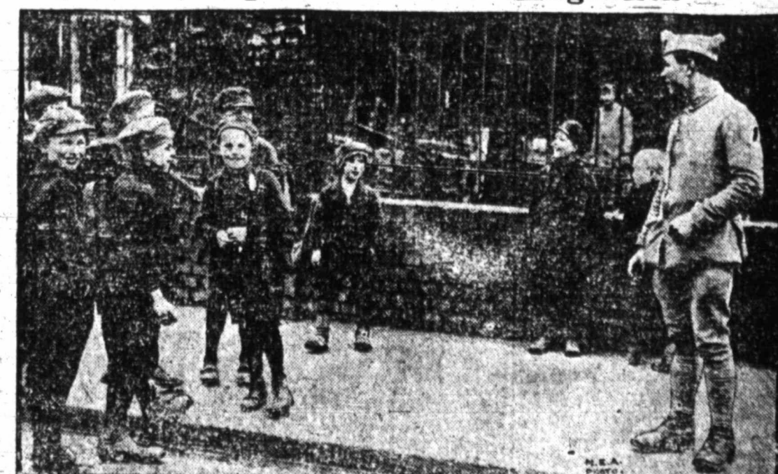
German youngsters are not afraid of the invaders. Here is a group of school boys "kidding" a French trooper after he has asked directions in the strange city.