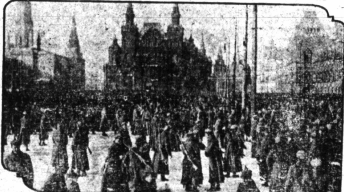
Over 5000 recruits, none over 24 years, mobilized in historic Kremlin Square, Moscow, when Trotsky called for his army. This was Trotsky's answer to the refusal of Poland to agree with Russia to a reduction of their armies.