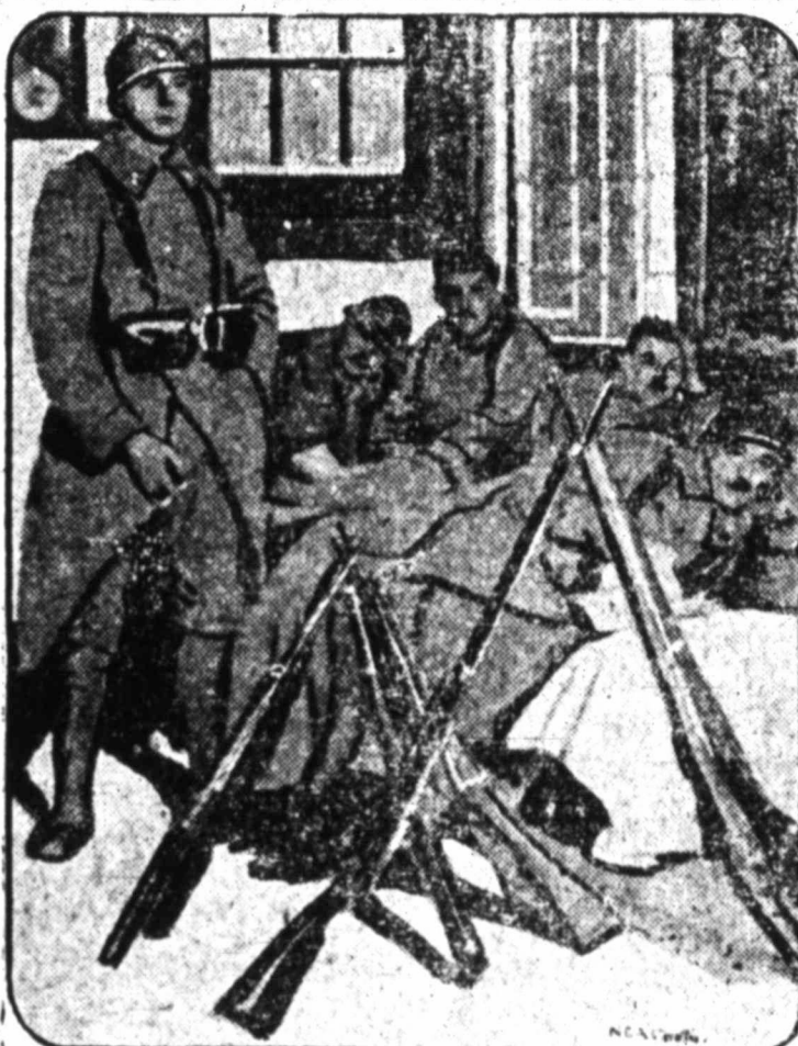
Here are shown a group of French militia quartered in the Kaiserhof, Essen's leading hotel, after the riot which broke out when driven from the dining room by French officers.