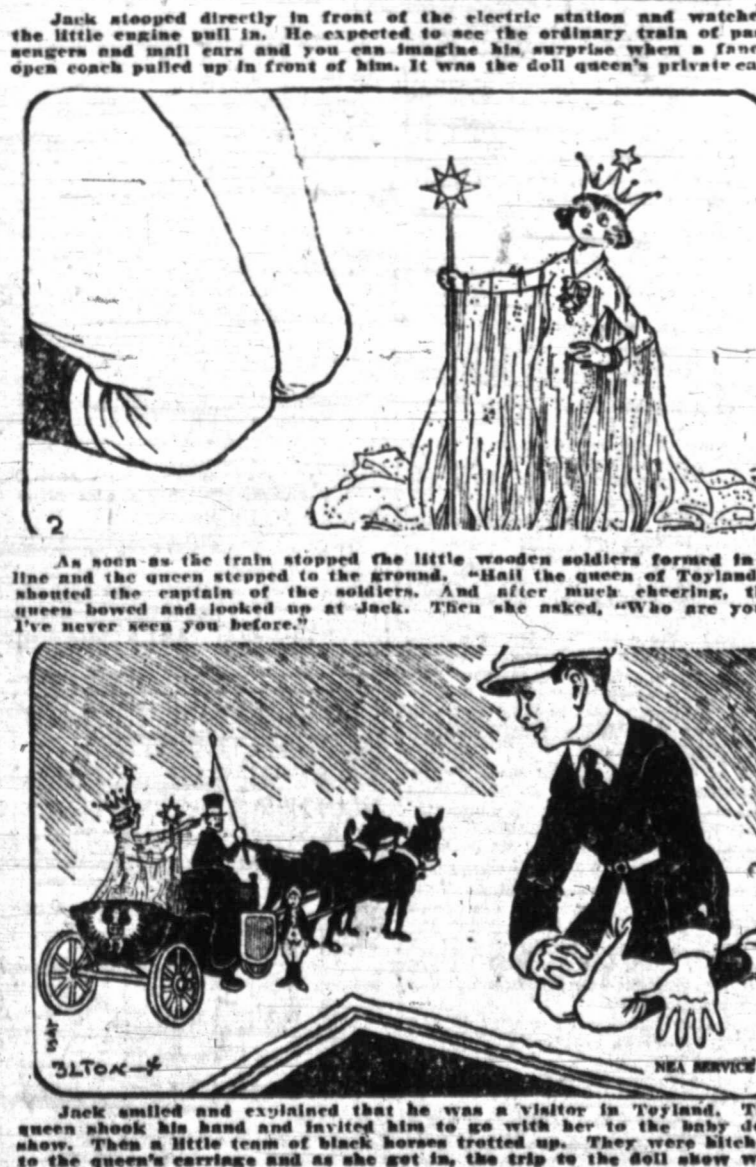
Jack smiled and explained that he was a visitor in Toyland. The queen shook his hand and invited him to go with her to the baby doll show. Then a little team of black horses trotted up. They were hitched to the queen's carriage and as she got in, the trip to the doll show was started. (Continued.)