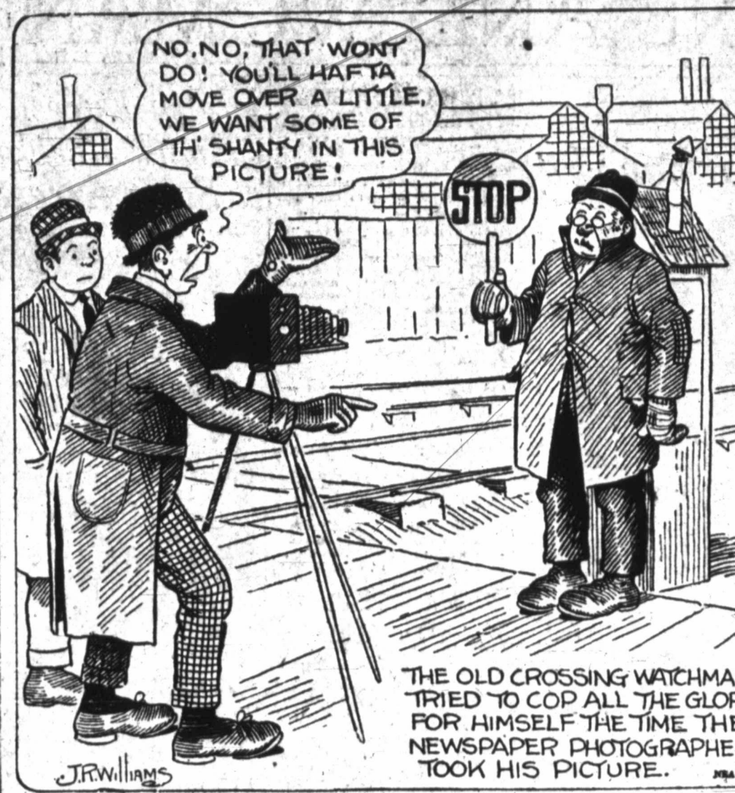
THE OLD CROSSING WATCHMAN TRIED TO COP ALL THE GLORY FOR HIMSELF THE TIME THE NEWSPAPER PHOTOGRAPHER TOOK HIS PICTURE.