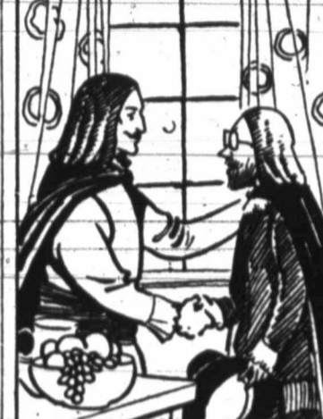
Captain Blood received him pleasantly.

consideration of your paying me the sum of fifty thousand pieces of eight ransom, thereafter granting me an unimpeded passage of the bar. If your excellency should be so ill-advised as to refuse the terms, I warn you that you may expect no quarter from us.