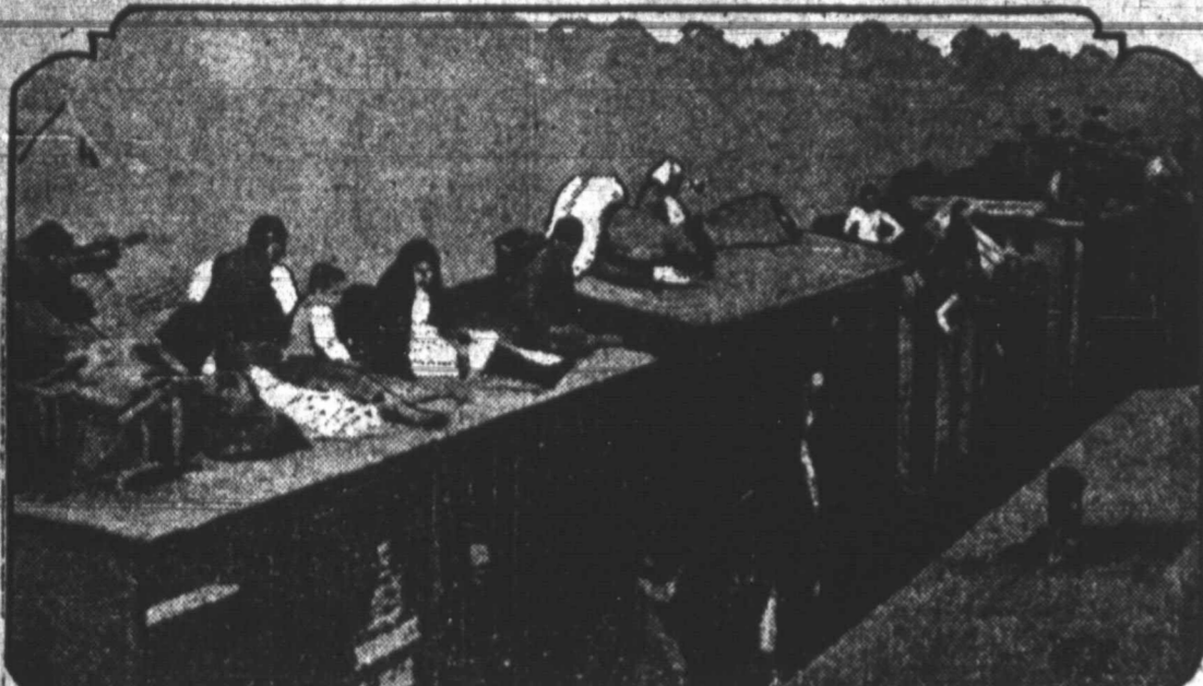
Freight and cattle cars, continually in movement, are the only homes many peasants of eastern Thrace have known for weeks. Here is a train with even its roof occupied by fleeing Christians, anxious to leave Thrace before the Turks come in.