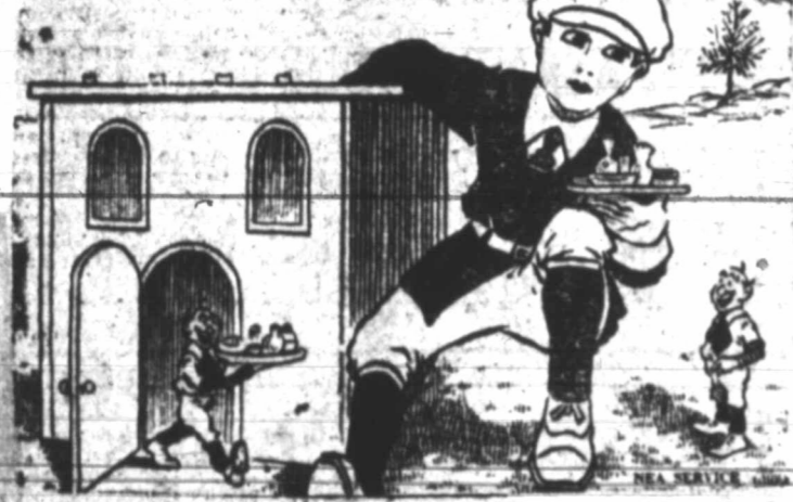
While little midgets walked on to and from the rest of the band of they folks seated themselves at the table. Jack laughed to watch them.