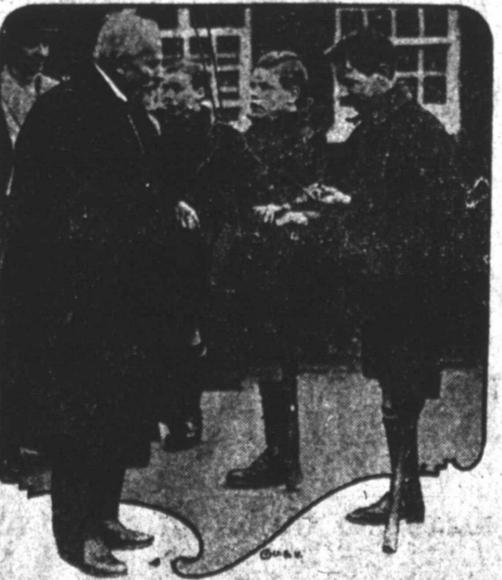
Emile Coué, the mental healer who is to visit America in January, preached good cheer to crippled children at the Hermitage Craft School and Home for Cripples at Sussex during a tour of England.