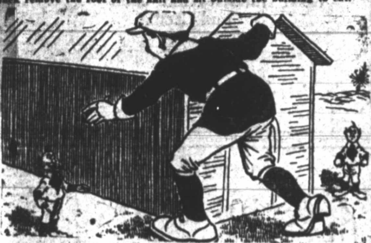
"That's a very good idea," said Jack, "I'll not do any damage to your auditorium because I can replace the roof when we are through."