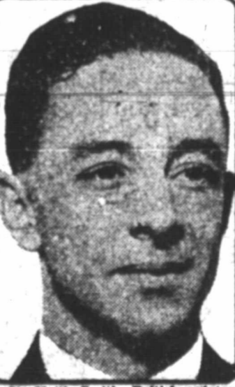
Sir Keith Smith, British aviator, above, was in San Francisco recently preparing for his flight around the world next spring. It will be the first around-the-globe flight ever attempted.