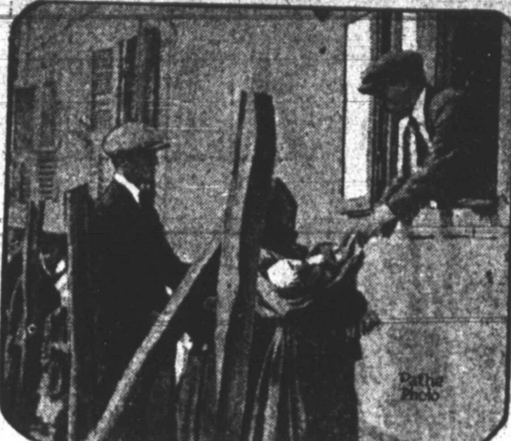
This eastern Thracian woman and her baby, doomed to quit their home because of the Turkish occupation, is receiving a dose of food from the American Red Cross in a small village.