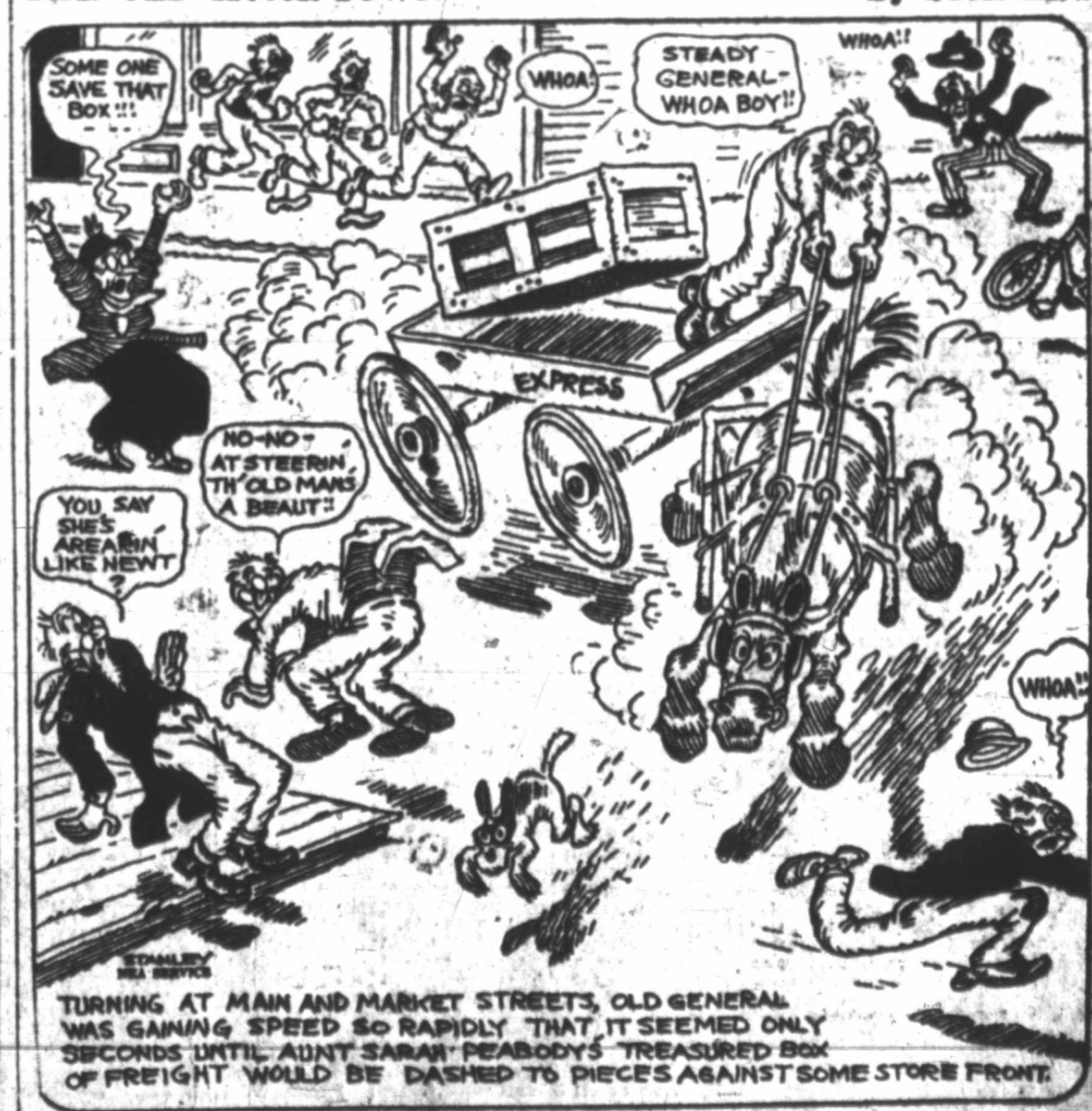
BUSTERS' BAD LUCK WORKS IN REVERSE GEAR