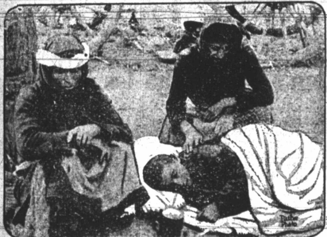
Hungry and footsore, these inhabitants of eastern Thrace have paused in their flight to minister to a child of the party who has fallen sick. These ragged pilgrims are Christians who are striving to get out of Thrace before the Turks occupy it.