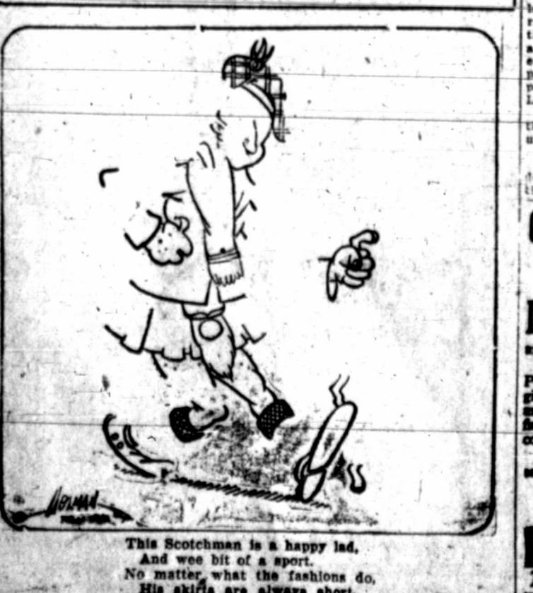
This Scotchman is a happy lad. And wee bit of a sport. No matter what the fashions do, His skills are always short.