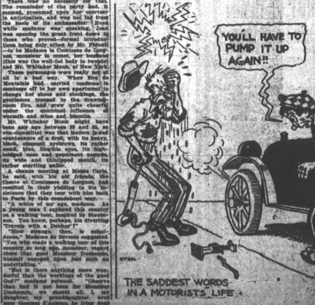
THE SADDEST WORDS IN A MOTORIST'S LIFE