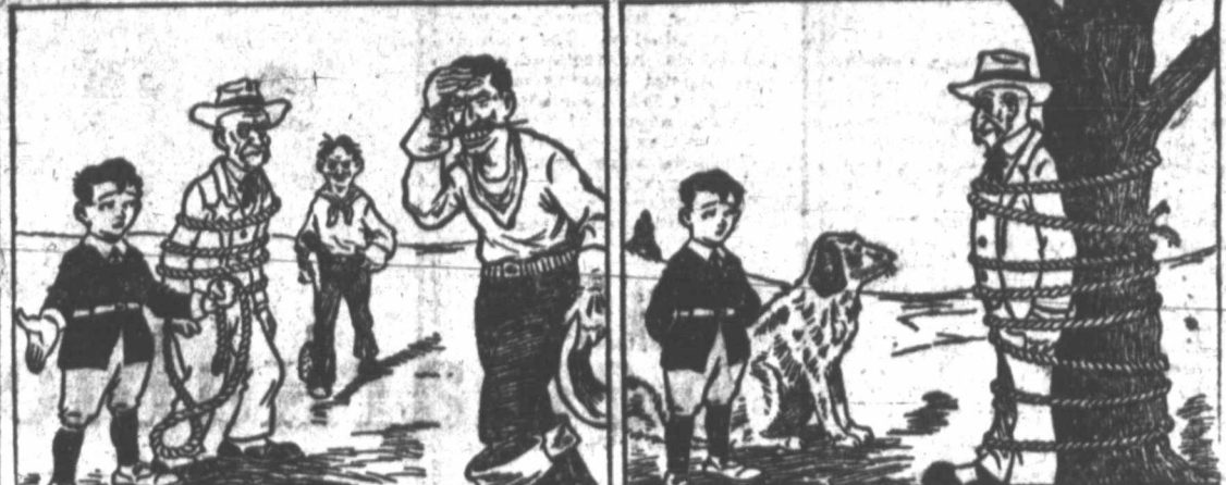
WHEN JACK WALKED INTO CAMP WITH HIS PRISONER, THE HORSEMAN JUMPED FOR JOY. THIS WAS HIS FIRST AND THE LAST TIME HE SAW THE GIRL WHO WAS HIS WATCH DOG.