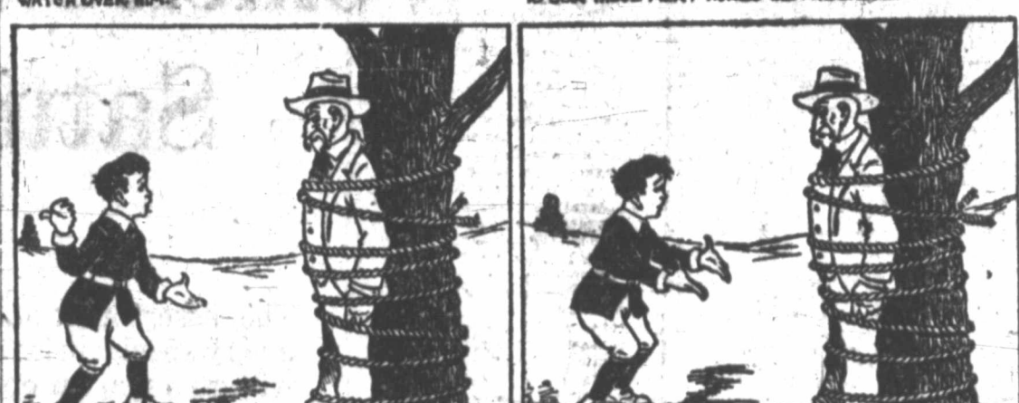
THEY WHO DO NOT SEE THE FAIRY LEFT, LEAVING JACK AND FLIP TO KEEP AN EYE ON THE PRISONER. JACK LIKED THE FAIRY AND STRIVED TO TALK TO HER. "WELL, YOU'VE GOT TO GO TO THE FAIRY. SHE'S A GOOD GIRL."