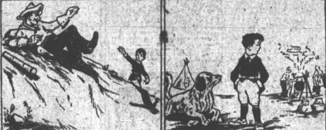
WHEN SUPPER TIME ROLLED AROUND A HORRORFUL CRASH UP ON THE HILLSIDE AND JACK'S PLANE, WHICH WAS GOING TO SLIDE DOWN TO CRASH AND BURN THE AREA WAS ALREADY GIVEN UP BY BOB.