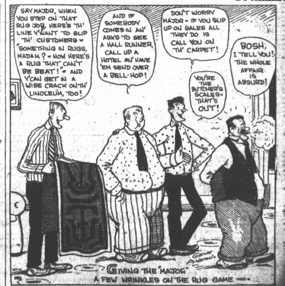
GIVING THE MAJOR A FEW WRINKLES ON THE RUG GAME