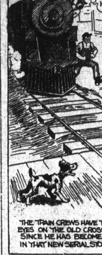
THE TRAIN CREWS HAVE TO KEEP THEIR EYES ON THE OLD CROSSING WATCHMAN SINCE HE HAS BECOME SO INTERESTED IN THAT NEW SERIAL STORY IN THE PAPER