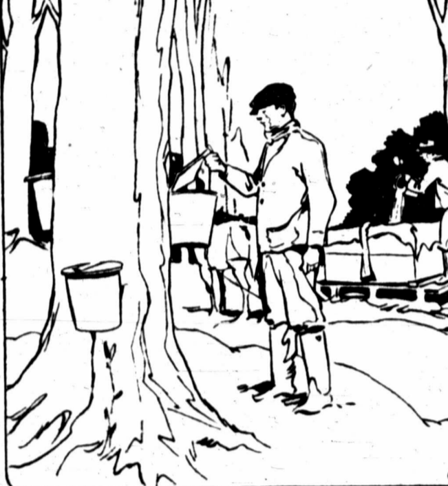
Let's take a trip across the land. Come on, kids, who is going? We'll start up in the state of Maine Where maple sap is flowing.

By HAL COCHRAN (Copyright, 1922, NEA Service) MAINE