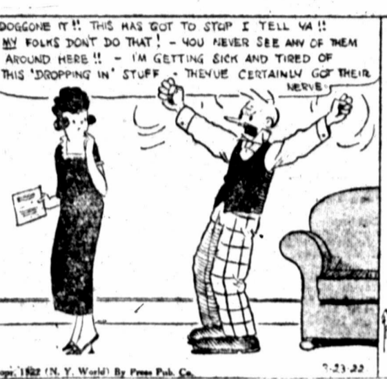
Cicero "Exploded" too Soon