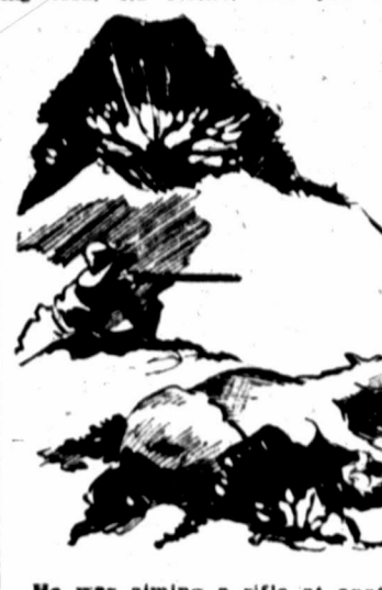
He was aiming a rifle at another man ensconced behind a cutbank.

"If Hale thinks I was at Hazel, it's reasonable to assume I might have had a hand in killing Rafe my own self. That goes double for Dan Silke, seeing he had the knife last."