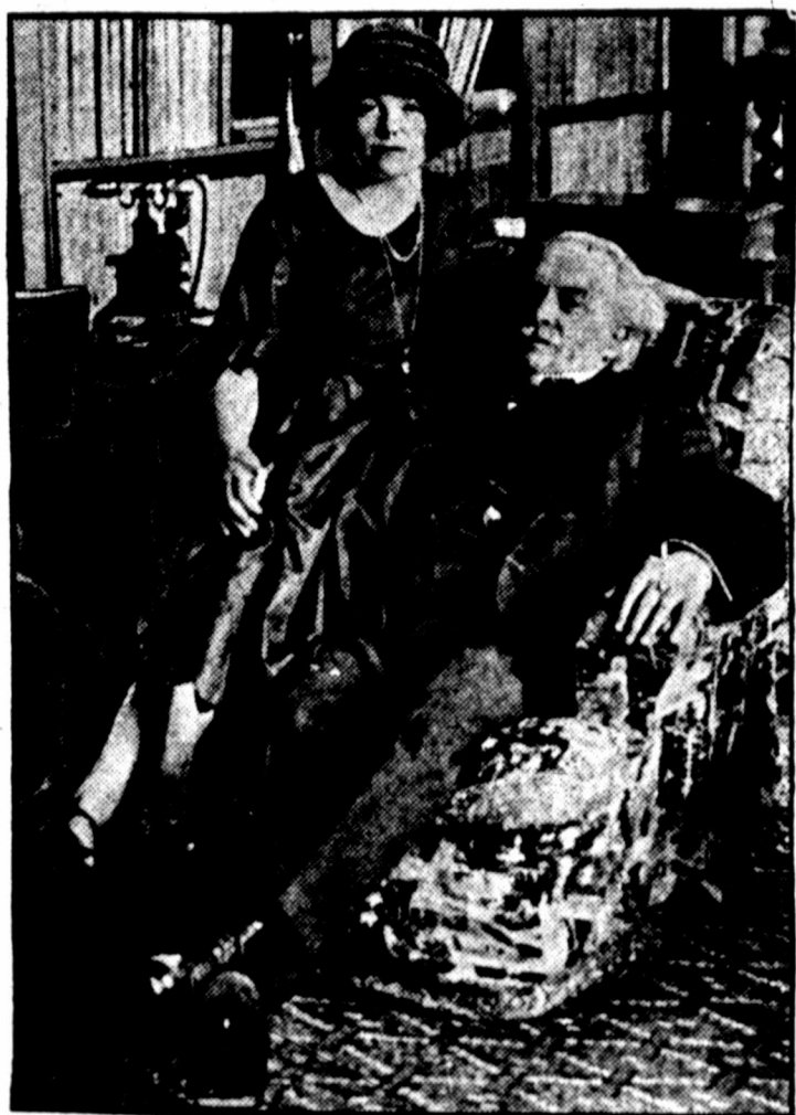
Premier Lloyd George spends a quiet Sabbath hour with his daughter, Megan, at Chequers in the lull that precedes another political storm with enemies in India, Africa and at home arrayed against him.