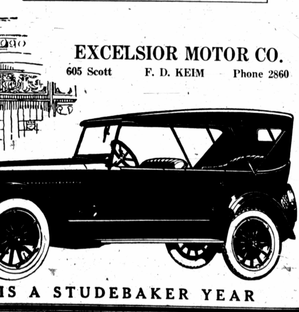
THIS IS A STUDEBAKER YEAR