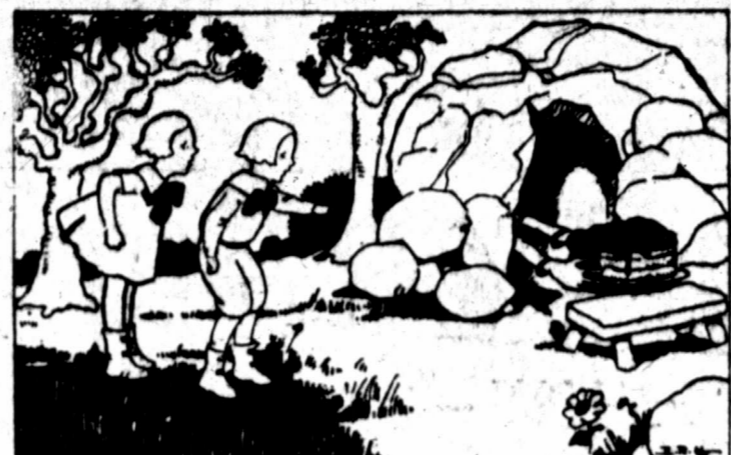
A pair of hands were just setting a large chocolate cake out to cool.

As soon as the twins left the orchard they stepped into a strange country. Not Whispering Forest or Bright Meadowland, or the low swampy place by Lily Pond, but a realm they had never seen before. It was quite plain that the little Green Shoes tucked away safely under the goldishes were taking them on an adventure into new realms of mystery.