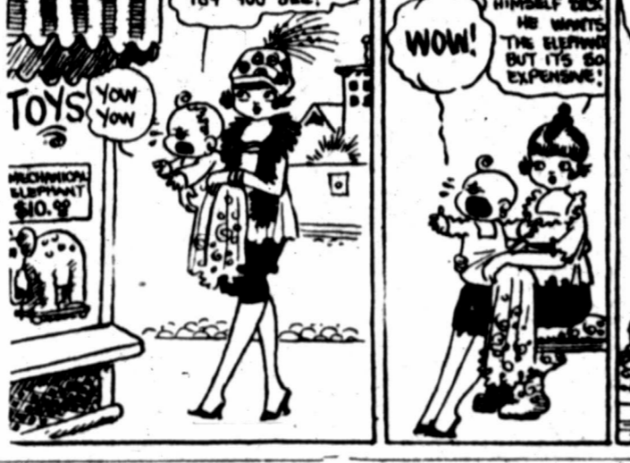
Starting a Menagerie Is a Big Undertaking