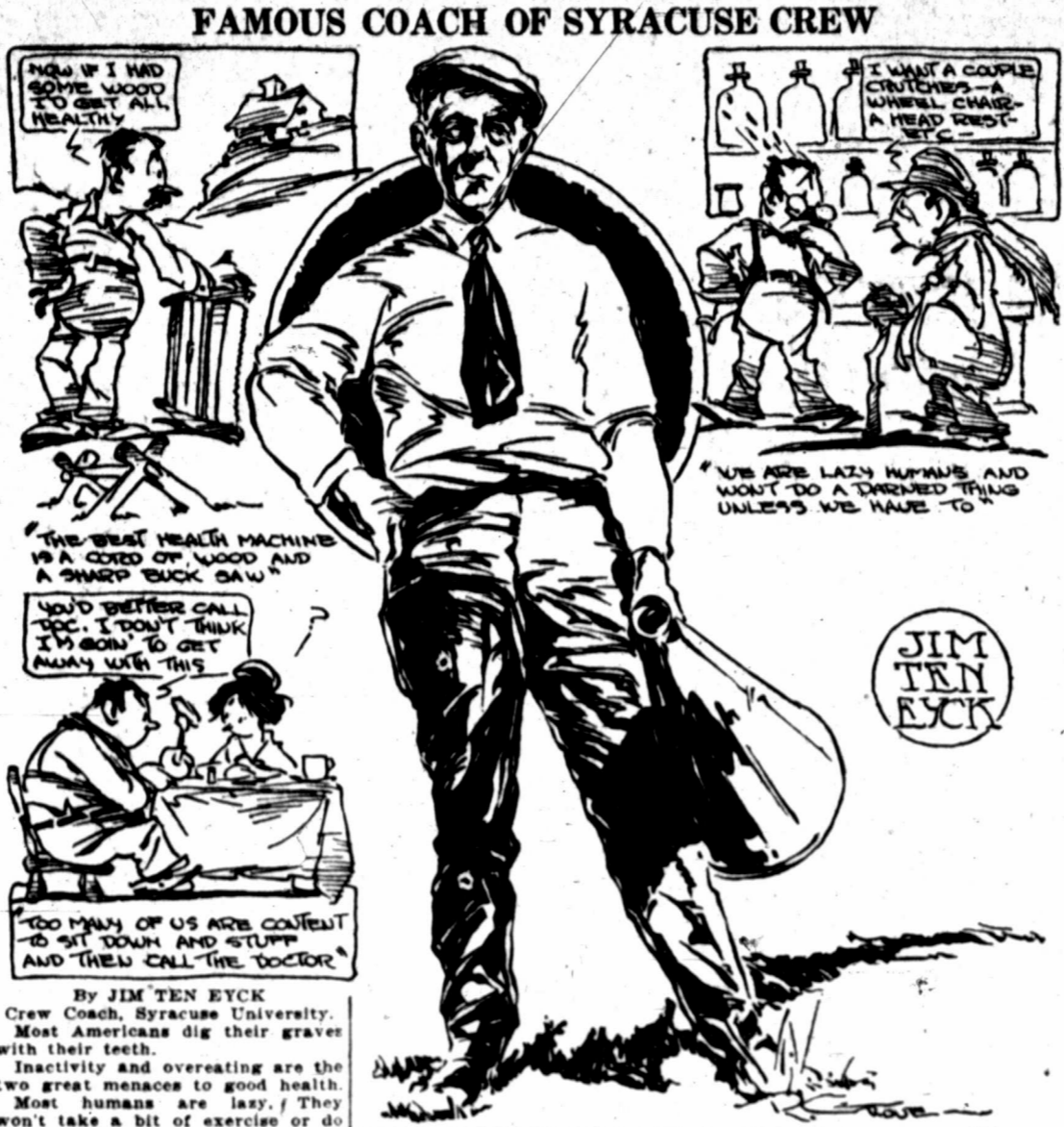
By JIM TEN EYCK

WOULD PROHIBIT QUAIL SHOOTING INDEFINITELY ST. PAUL, MINN., March 2.—Quail are song birds, according to the executive committee of the State Humane Society. Maintaining that they are also allies of farmers, resolutions adopted by the committee urge that all farmers of the state they inhabit be asked to wear a badge for them. It was asserted that the work and the small amount of grain thus expended would be abundantly repaid in the destruction of insect pests and the seeds of noxious weeds. The resolution also proposes that quail shooting be prohibited indefinitely. Without such protection the birds are in danger of extermination, says Sam F. Fullerton, executive agent of the society. The society wants quail shooting stopped for a generation at least, he adds. Although there is now a closed season on quail in this state it will soon expire.