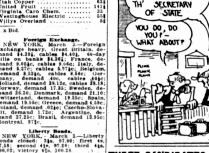
The Proper Department