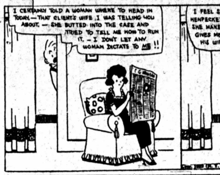
Gets Told Where to Head In