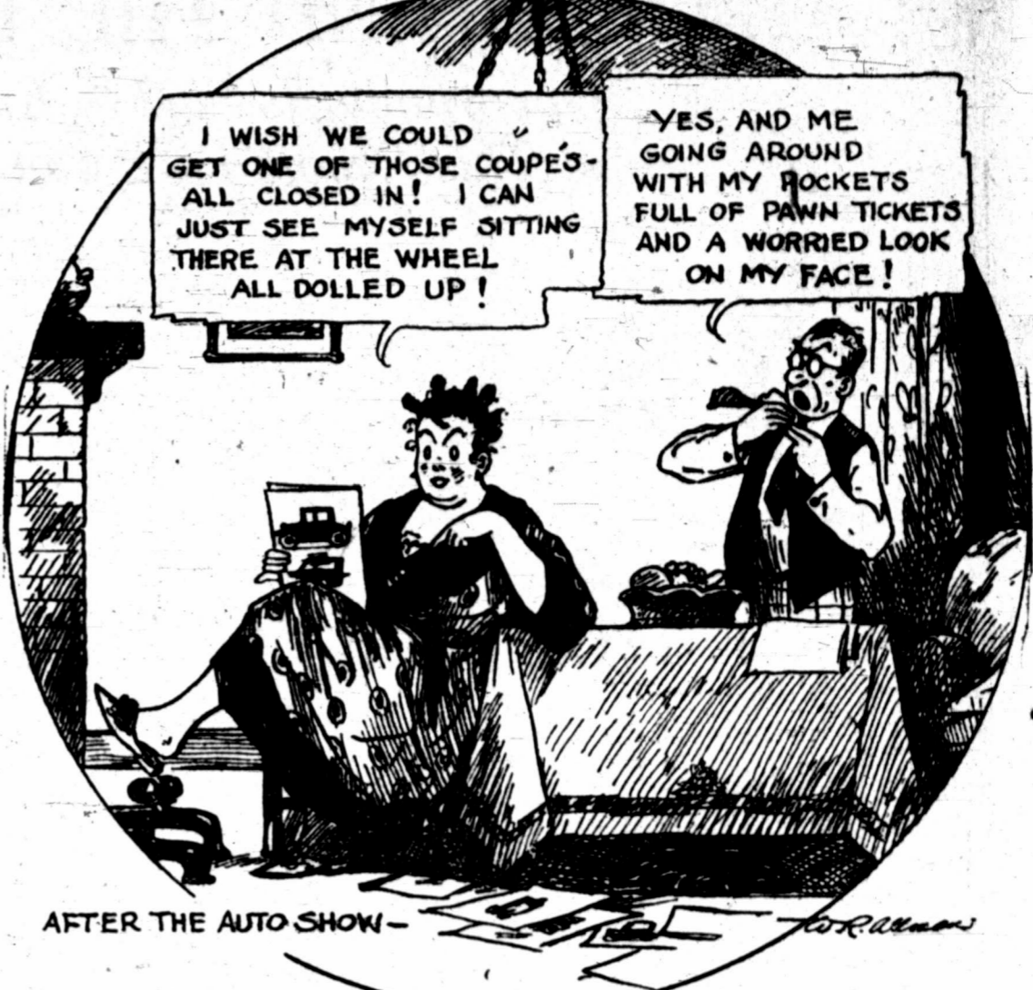
AFTER THE AUTO SHOW

HAMBONE'S MEDITATIONS BOSS LET DAT HOSS STAY UP IN DE LOT ALL DAY LONG EN AIN' WEARY BOUT IT, BUT EF HE SEE ME STANDIN' ROUN' HE PUT ME T' WORK!!