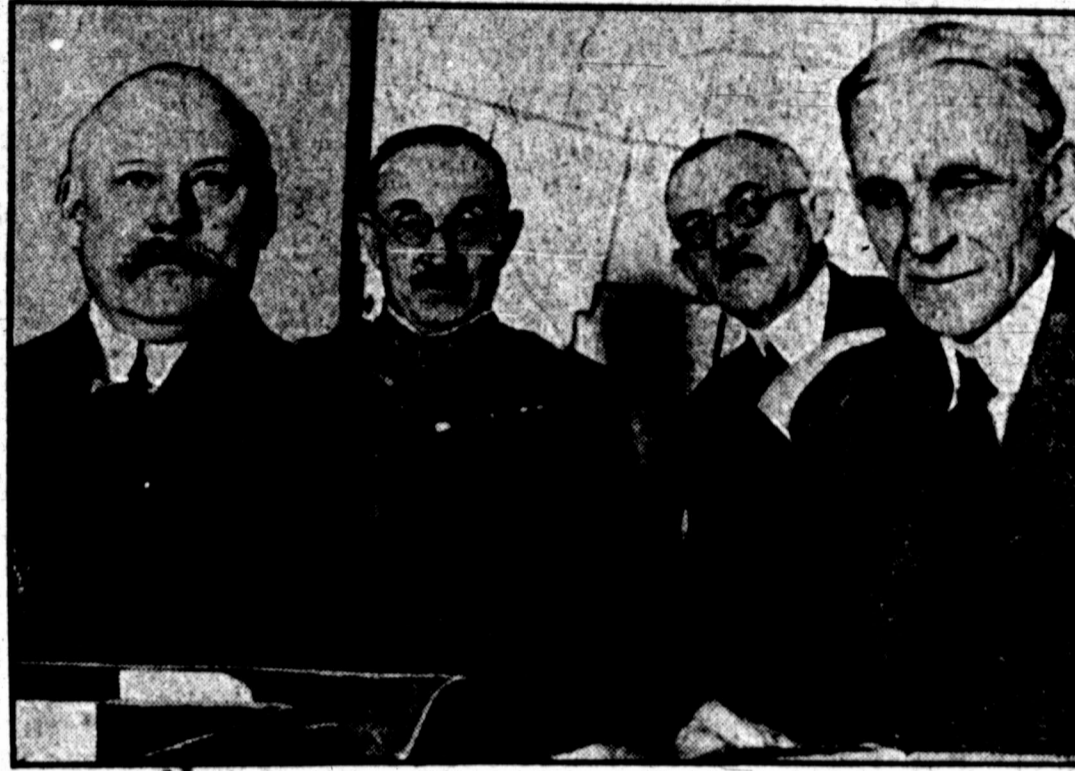
Secretary of War Weeks and Henry Ford in conference in Weeks' office in the war department.

CONOLIDATION OF MANAGEMENT AS A CURE FOR IDLENESS