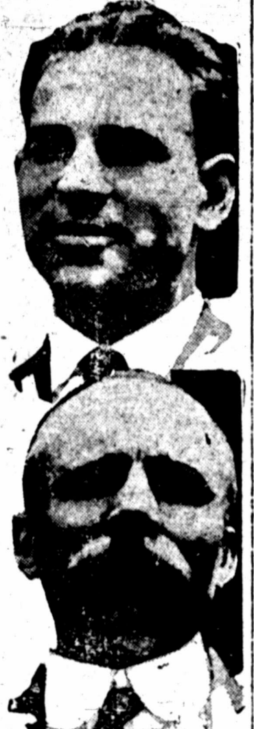
NICOLA SACCO (ABOVE) AND BARTOLOMEO VANZETTI