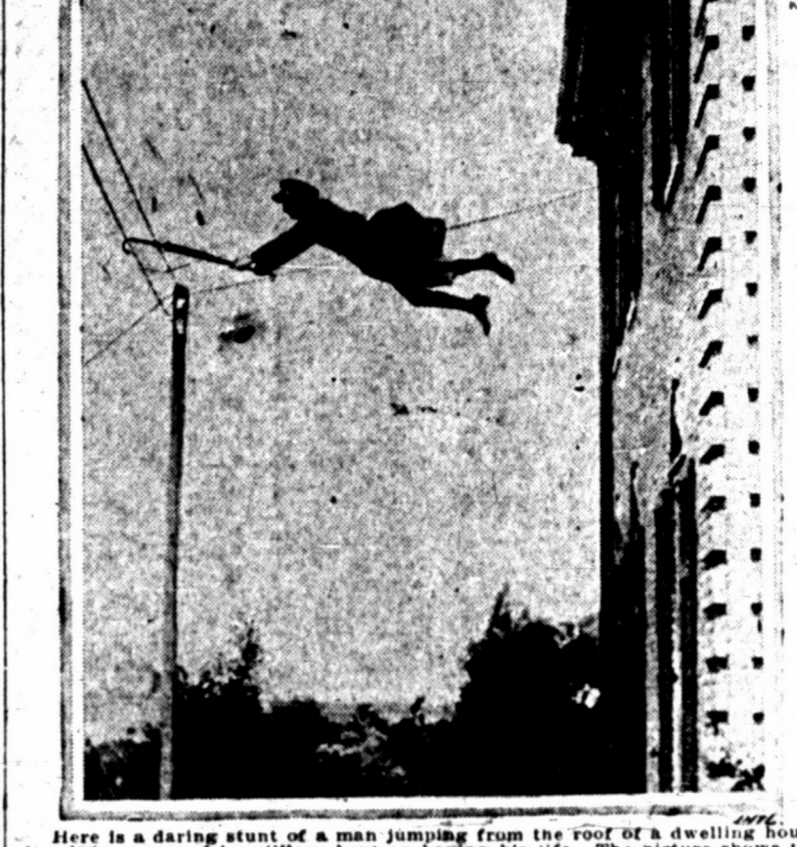
Here is a daring stunt of a man jumping from the roof of a dwelling house after being pursued by villains bent on having his life.