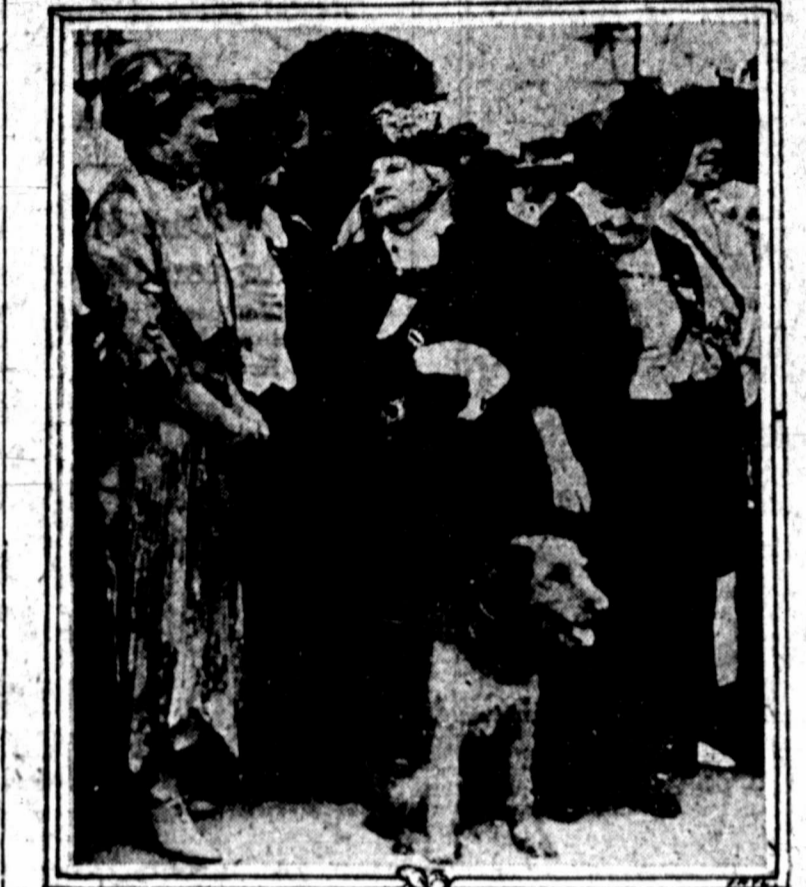
At the recent convention of the United Daughters of 1812 at Washington a number of the delegates called on Mrs. Harding and were entertained by the "First Lady of the Land"...