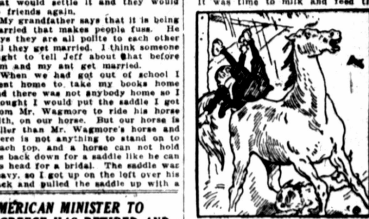
And I fell right down on his back.