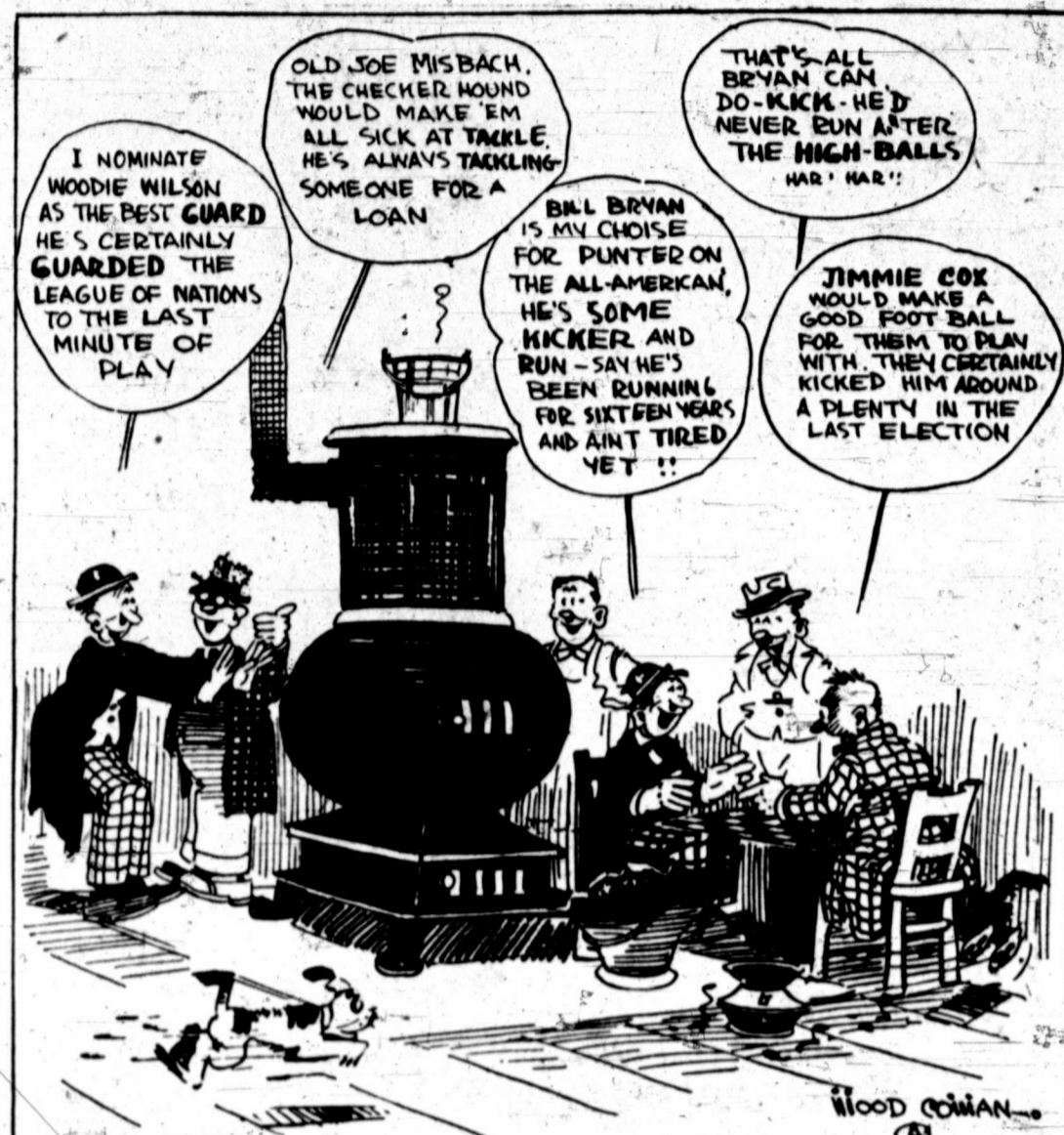
THE STOVE LEAGUERS POK IN ALL-AMERICAN FOOTBALL TEAM