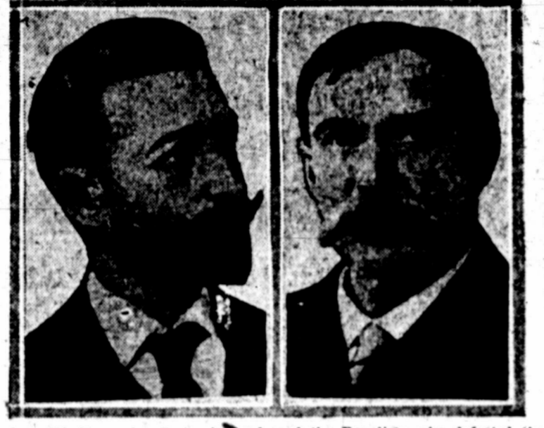
Left—M. Demetrios Gounaris, leader of the Royalists who defeated the Liberals headed by Premier Venizelos, in the recent elections in Greece. Right—Demetrios Rihatis, former Premier who has been asked to form a new Ministry.