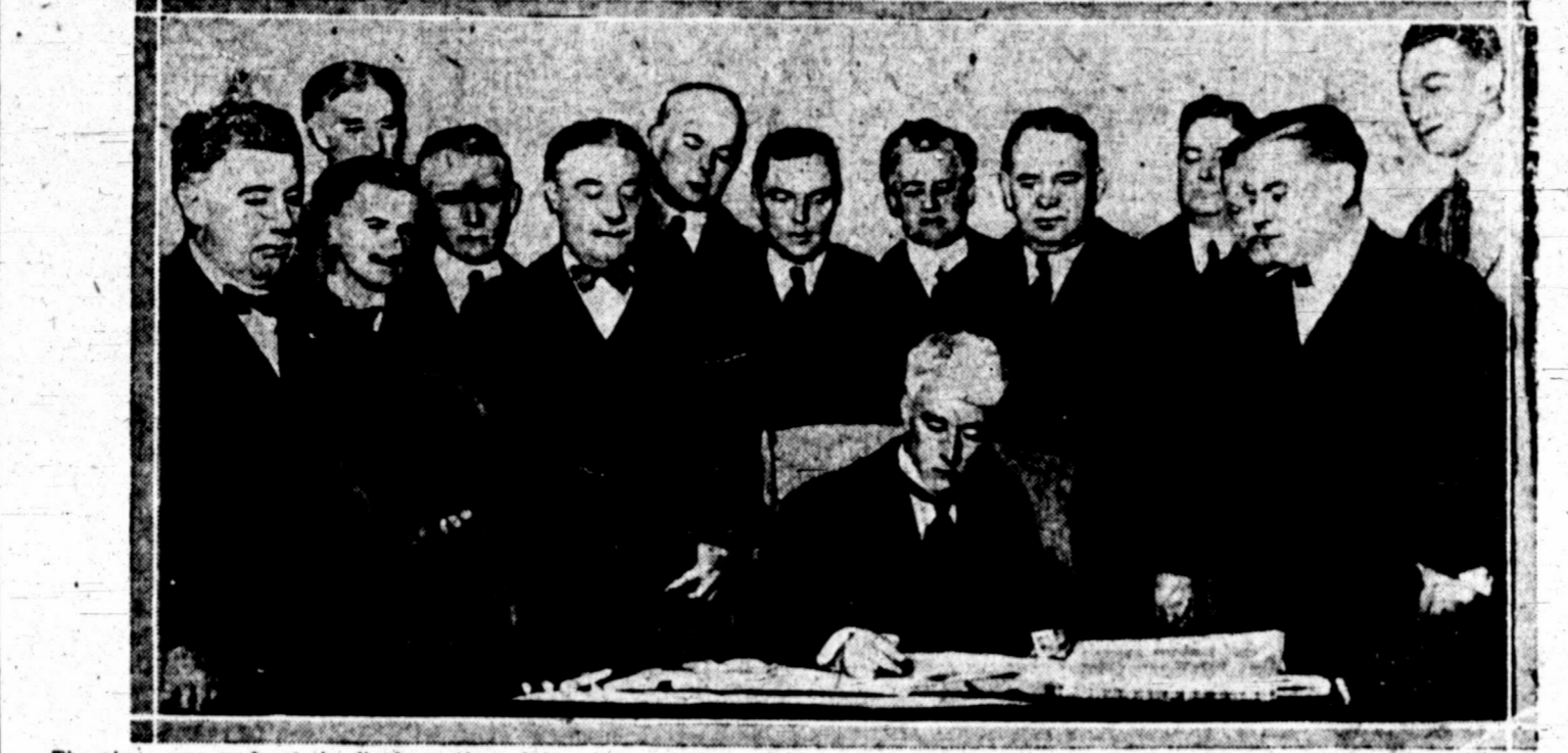
The photo was made at the final meeting of American and National League owners and representatives in Chicago, which marked the ending of the threatened baseball war.