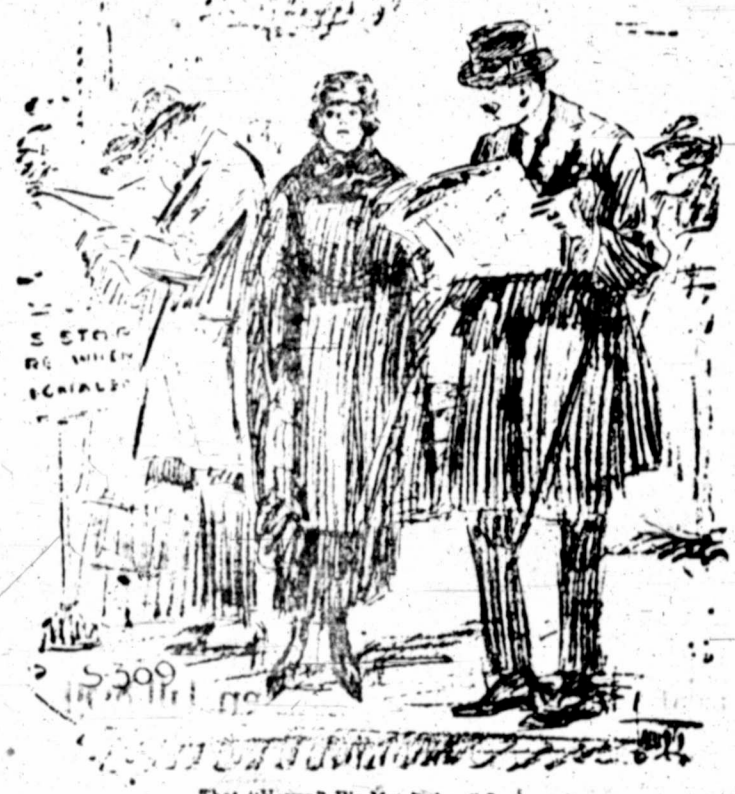
That "Haven't We Met Before" Smile