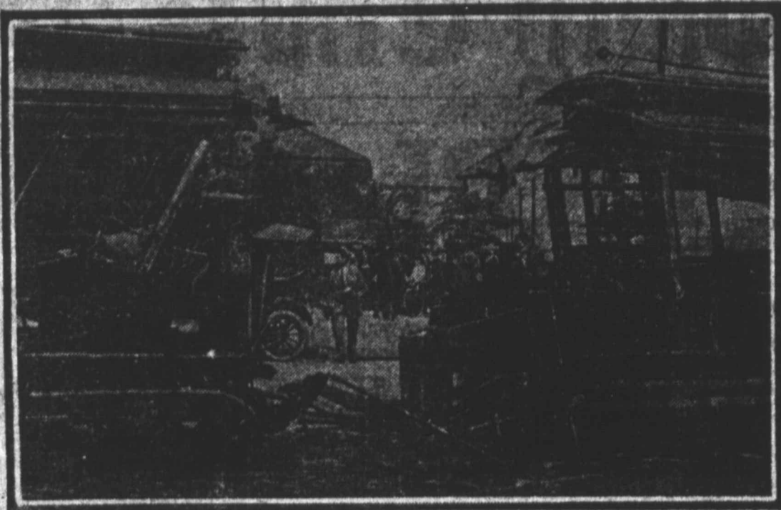
One dead and eleven injured is the report from Brooklyn, where three U. S. T. surface cars collided. An investigation is being made, as the cars were run by strike breakers.

selves the right of selection of candidates, notwithstanding what may have been decreed by the people themselves.