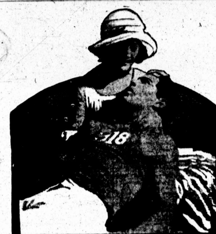
REX BEACH'S "Going Some"