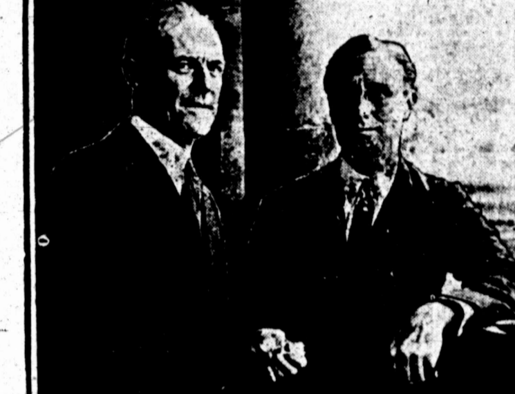
FRANKLIN D. ROOSEVELT AND GEORGE WHITE DISCUSSING THE COMING CAMPAIGN AT THE DEMOCRATIC HEADQUARTERS, GRAND CENTRAL PALACE, NEW YORK CITY.