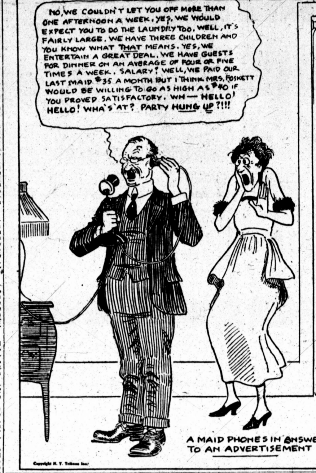
A MAID PHONES IN ANSWER TO AN ADVERTISEMENT