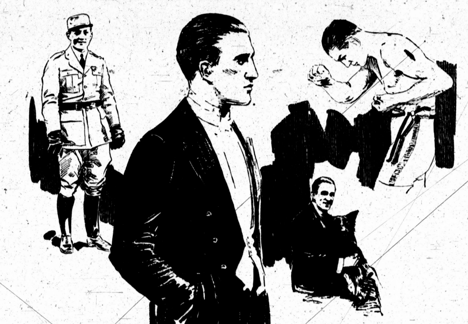
The above picture shows Georges Carpentier, the French heavyweight, as a soldier, gentleman, fighter and sportsman. Joy reigned supreme recently in the Frenchman's camp when it was learned that Dempsey was cleared of his draft evasion charges. Carpentier is more than anxious to get a crack at Jack and the announcement of a date for a bout between the two is looked for in the near future. It is barely possible that Carpentier will show here a week from Monday, but the sudden turn of things since Dempsey's trial may force him to change his plans.