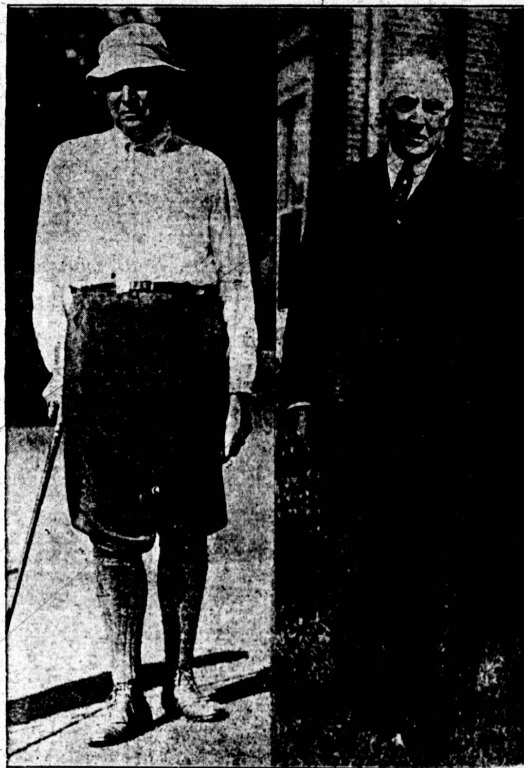
Senator Harding in front of his Washington residence and thoroughly enjoying a game of golf.