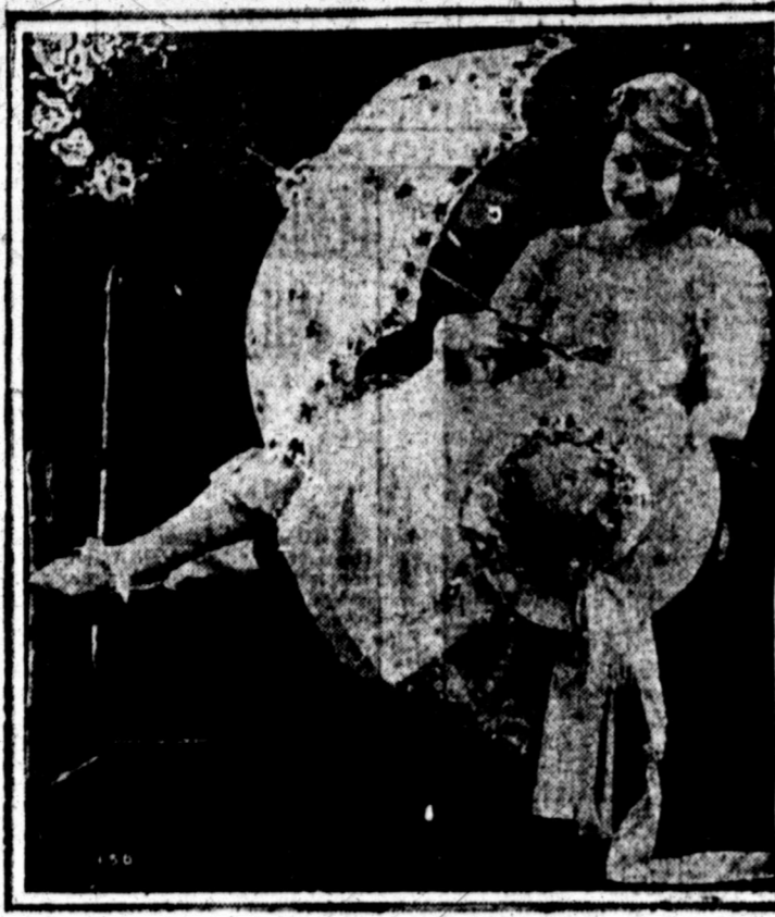
A charming vision one might hope to find in a summer garden with her new hat and parasol trimmed with satin-de-luxe ribbon.