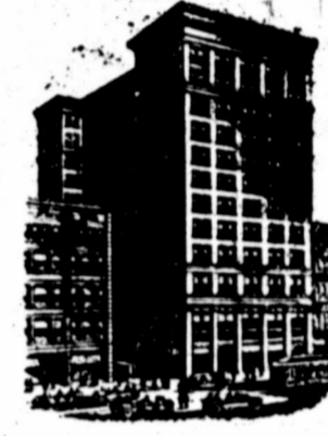
Home Office Building

A disability clause keeps up all payments for loss of health besides paying a guaranteed monthly income for life.