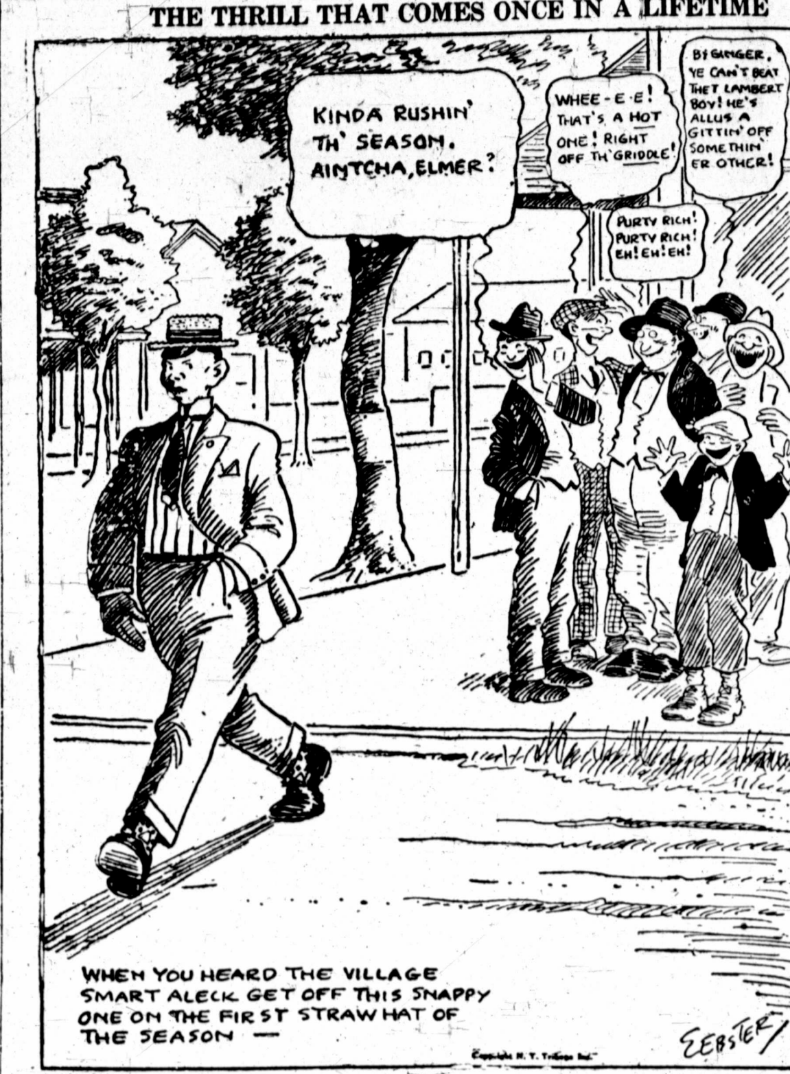
WHEN YOU HEARD THE VILLAGE SMART ALECK GET OFF THIS SNAPPY ONE ON THE FIRST STRAW HAT OF THE SEASON

WHY? ARE LEAD PENCILS SO CALLED? (Copyright, 1920, by Wheeler Syndicate, Inc.) The obvious answer to this question would be, "Because they have lead in them." But they haven't. The writing material in the "lead" pencils of today is graphite, not lead. But there was a time, before the discovery of the famous graphite mine in Cumberland, England, when metallic lead was used inside a wooden holder or shield, and the name persisted even after the lead itself disappeared. After large deposits of graphite were located in England in 1565, that country had practically a complete monopoly of the lead pencil industry for some 200 years. In fact, it was not until 1761, when Caspar Faber opened his pencil factory at Nuremberg, in Bavaria, that Germany took the lead in the making of this product. The establishment of the tariff which went into effect in 1861 made the importation of lead pencils into the United States a very expensive operation and forced a number of manufacturers to establish plants in this country. American inventive genius perfected many of the machines which made the pencils and today the United States supplies at least 90 per cent of the pencils used on this side of the Atlantic. The considerable proportion of those which are utilized by the world at large. The graphite comes principally from Ceylon, Mexico, Bohemia and Siberia, while the red cedar wood is obtained from Florida, Alabama and Tennessee. Tomorrow's question—Why do we speak of a "porter house" steak?