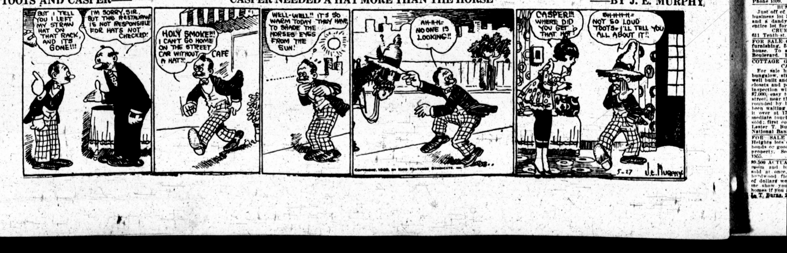
CASPER NEEDED A HAT MORE THAN THE HORSE