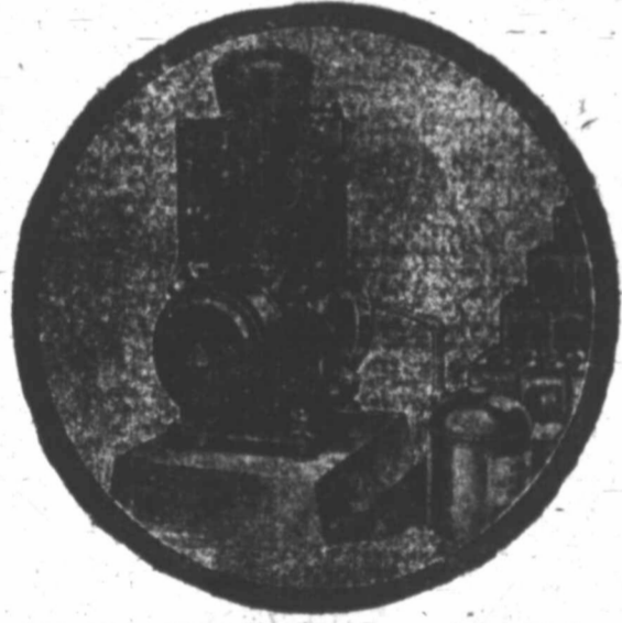
Delco-Light Model No. 320. For ranches, large farms and hotels. Ample light and power capacity.

THERE is a model of Delco-Light designed and made to suit your particular need for electric light and power service.