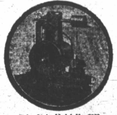
Delco-Light Model No. 9025. A special plant for oil rig service. Portable. Can be used anywhere.

All Delco-Light plants are air-cooled, direct-connected, and use kerosene, gasoline or gas as fuel. Over 100,000 of them are in daily operation.