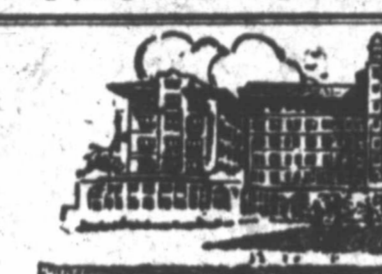
Illustration of a large building, likely a hotel or resort.

The Senior B. Y. P. U. entertained with a pleasant social in the reading room of the Baptist church Saturday evening, where the hours were given over to games, music and general parlor amusements. In the concluding hours a treat of cream and cake was served. Those present were the following young ladies and gentlemen: