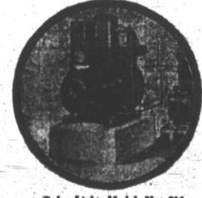
Delco-Light Model No. 216. The standard Delco-Light plant for the average farm, store and church.