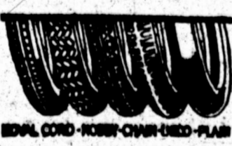
ROYAL CORD ROBEY-OWEN-USED-PLAN

Shed your tires according to the roads they have to travel. In dandy or billy country, wherever the going is apt to be heavy—The U. S. Nobby. For ordinary country roads—The U. S. Chain or Union. For front wheels—The U. S. Flank. For best results—everywhere—U. S. Royal Cord.