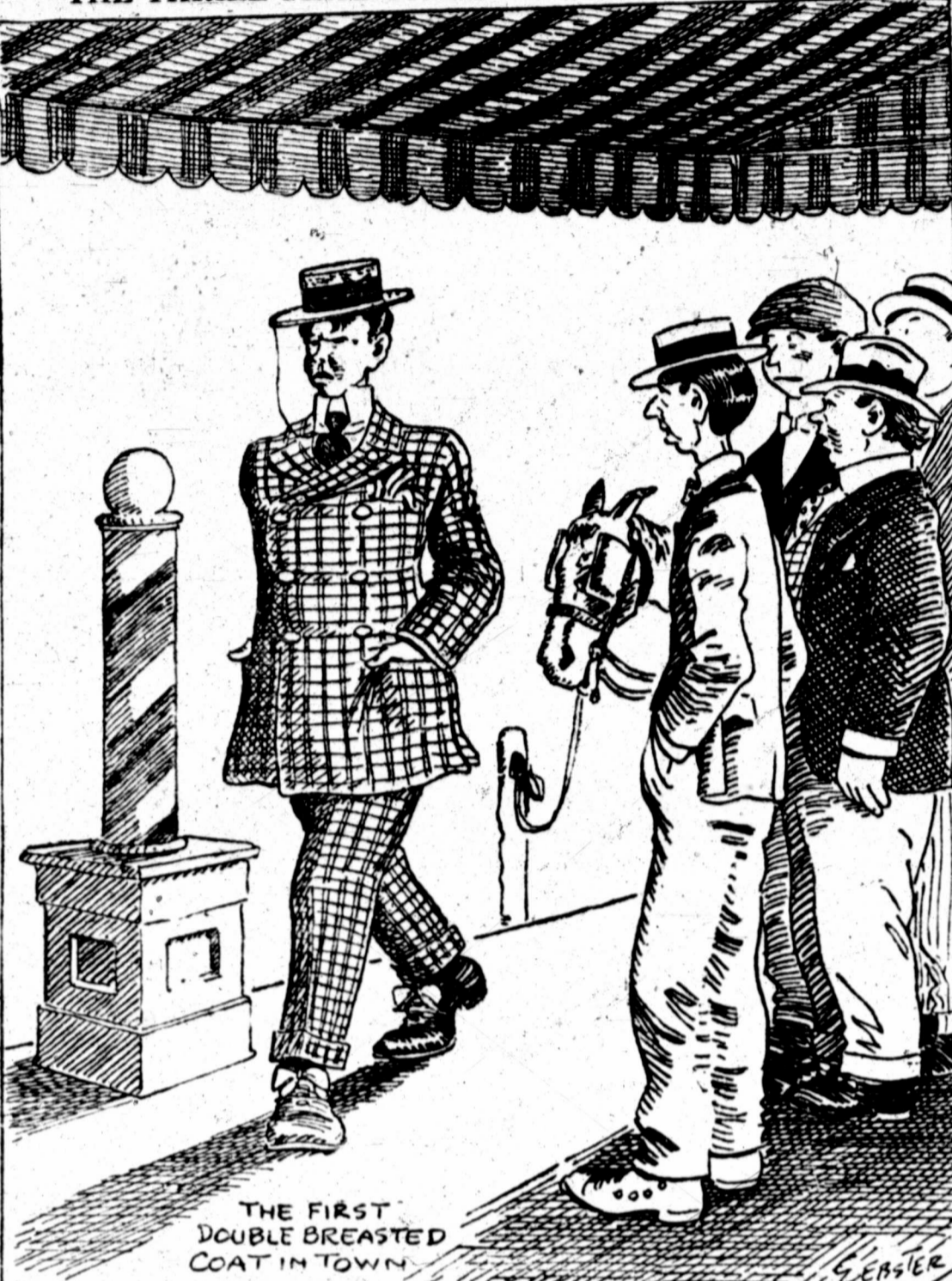
THE FIRST DOUBLE BREASTED COAT IN TOWN