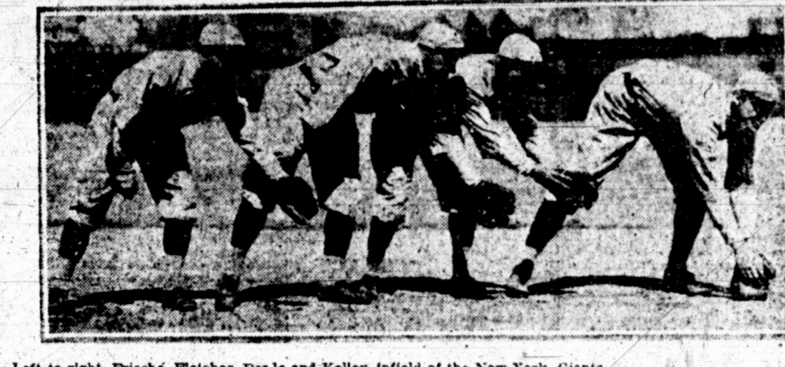
Left to right, Frische, Fletcher, Doyle and Kelley, infield of the New York Giants.