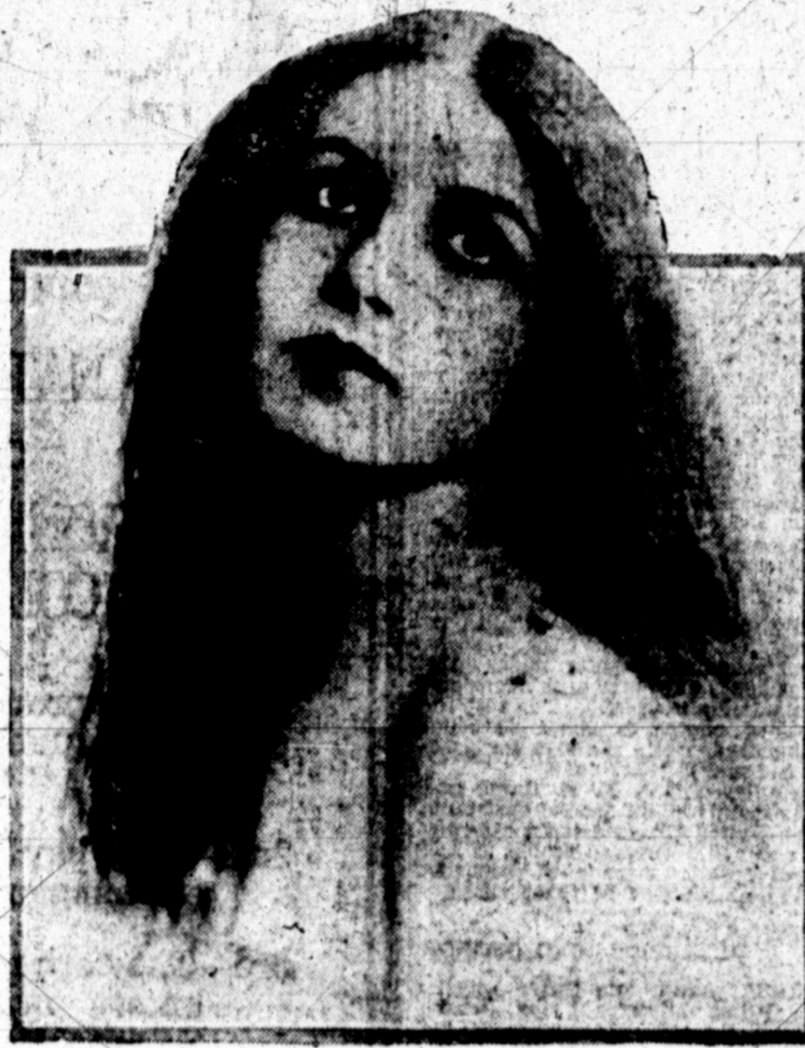
"Women used to develop grace and beauty, healthy and supple bodies, and so accomplish this there is no need for strenuous exercise or regimental calisthenics. It is only necessary to dance, and dance freely, without restraint, and particularly the strenuous dances of the Russian peasant, rather than the Russian ballet dancer." Such is the firm belief of Vera Zimeleva, a famous Russian dancer.