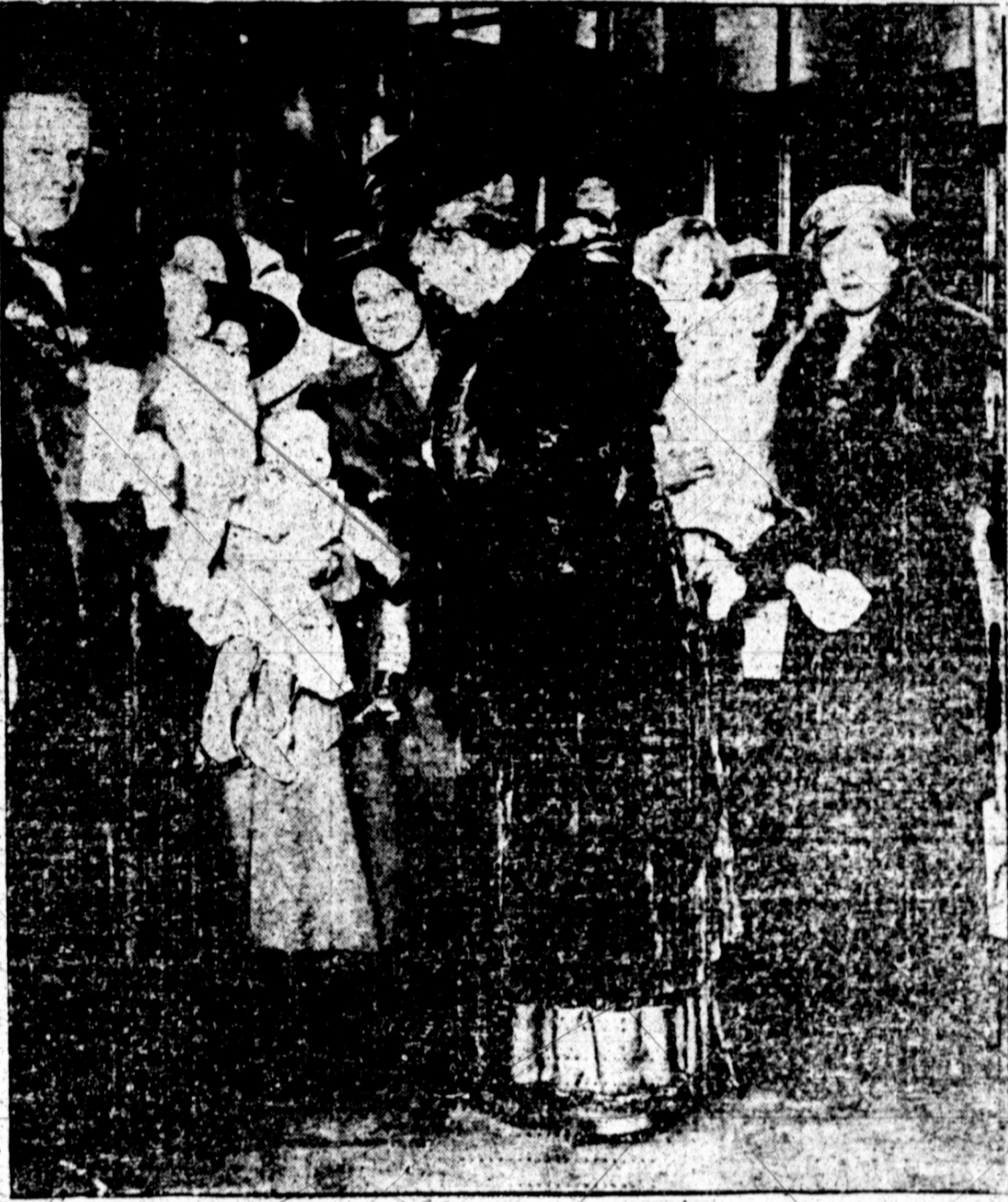
The photo shows the interest the Queen takes in the tiny tots of England. With Princess Mary, the Queen visited the infant welfare centre in the Borough of Wandsworth, London, recently.